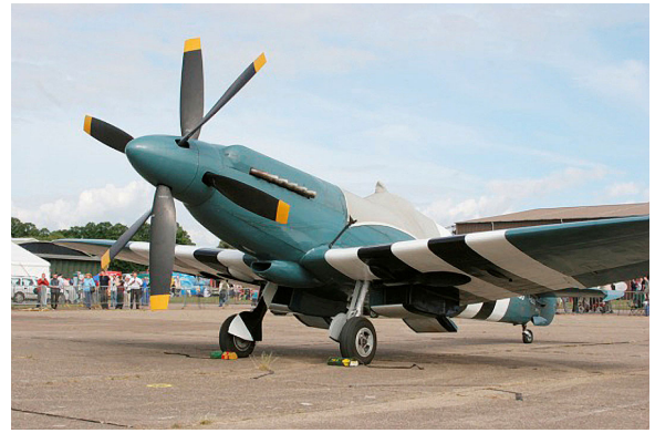
Supermarine Spitfire XIX Canopy Cover