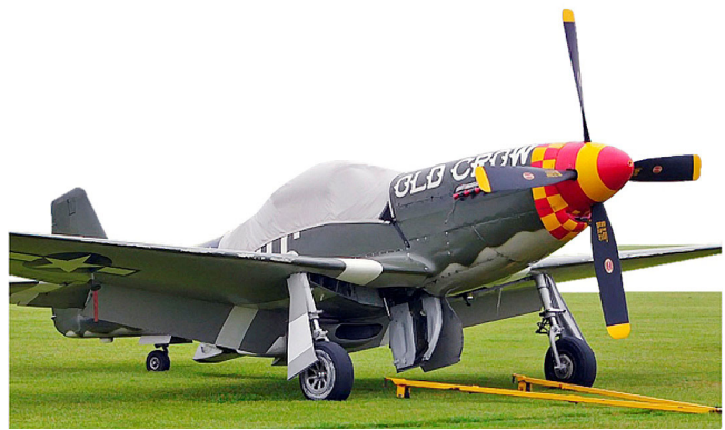
Canopy Cover, Chin Scoop & Exhaust Plugs