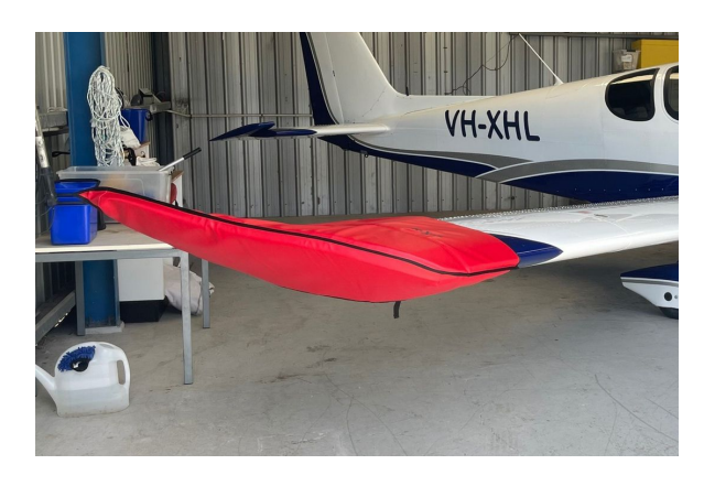
Sling TSI Wingtip Pads