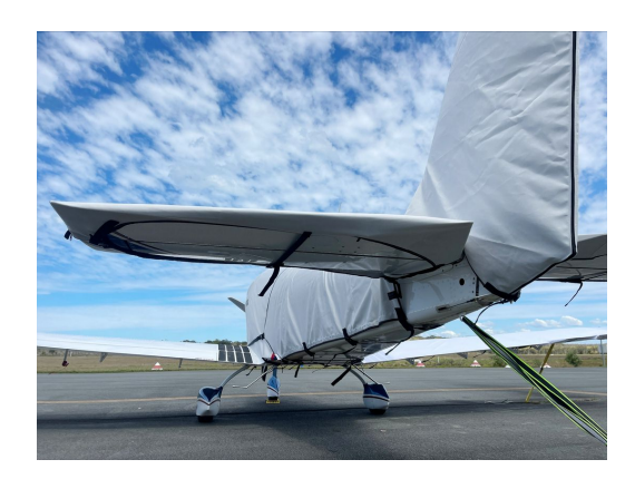
Sling 4 TSi Empennage Cover

WINTER USE MATERIAL - Made with Solution-Dyed Polyester fabric, this option is intended for seasonal use to aid in deicing, rain mitigation, or for occasional travel. The material is lighter and more compact, but more susceptible to UV damage and may have a shorter useful life if used continuously outside than the all-year use material.