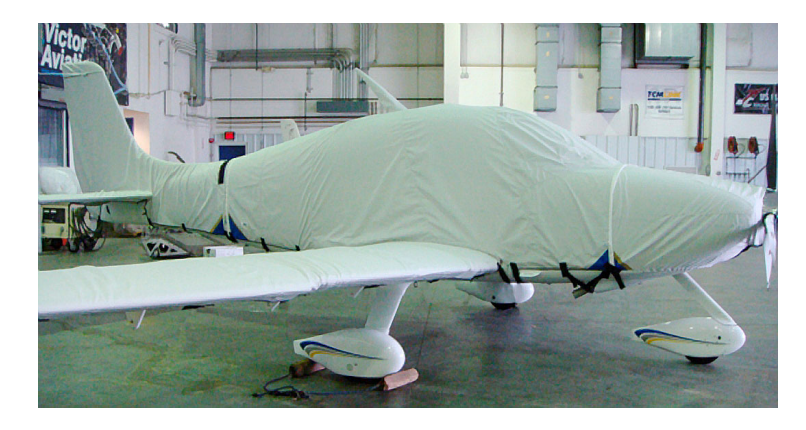
Cirrus SR20 Full Cover Set (Extended Canopy Cover, Engine Cover, Wing Covers, Empennage Cover)