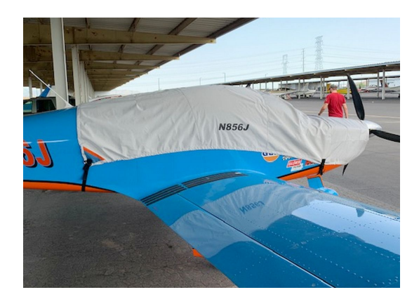
Airplane Factory Sling 4 Canopy/Engine Cover

This cover type is made from Silver Acrylic Sunbrella canvas and is 100% lined with a soft and smooth microfiber. Bruce's Custom Covers developed this material combination especially for aircraft protection. The outer material is medium weight and treated for water resistance, UV resistance and anti-static buildup. The inner lining is a very soft and smooth microfiber to prevent scratching. The material is very reflective, and tests show that the cabin interior temperature can be reduced to near-ambient temperature on the hottest of days. It is water, ice and snow repellent, yet breathable to allow moisture to escape from between the cover and the aircraft surface.