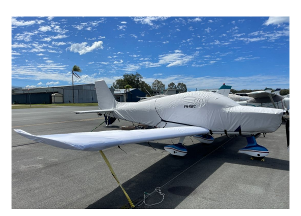
Sling 4 TSi Complete Cover Set