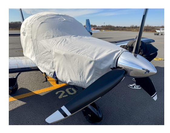
Sling TSi Extended Canopy/Engine Cover