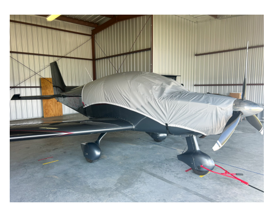
Sling TSI Travel Cover, Light Weight Canopy/Engine Cover