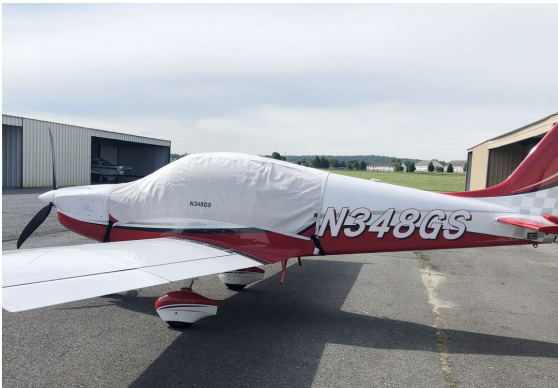
Airplane Factory Sling 2 Canopy Cover

This cover type is made from Silver Acrylic Sunbrella canvas and is 100% lined with a soft and smooth microfiber. Bruce's Custom Covers developed this material combination especially for aircraft protection. The outer material is medium weight and treated for water resistance, UV resistance and anti-static buildup. The inner lining is a very soft and smooth microfiber to prevent scratching. The material is very reflective, and tests show that the cabin interior temperature can be reduced to near-ambient temperature on the hottest of days. It is water, ice and snow repellent, yet breathable to allow moisture to escape from between the cover and the aircraft surface.