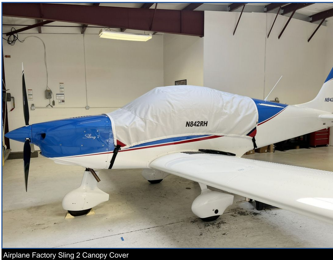
Airplane Factory Sling 2 Canopy Cover