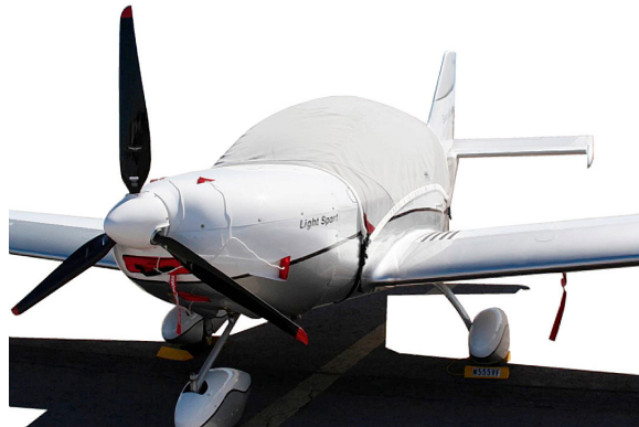
Sportcruiser Canopy Cover & Plugs

Travel Covers are made with Silver Solution-Dyed Polyester fabric and only lined over the windshield to save weight. The material is lightweight and more compact for easy stowage in the aircraft. The polyester material is water resistant, but only intended for occasional use outside. We also have an ultra lightweight material available for fitted hangar dust covers. For daily outdoor use, the non-travel Sunbrella Cover is the best choice.