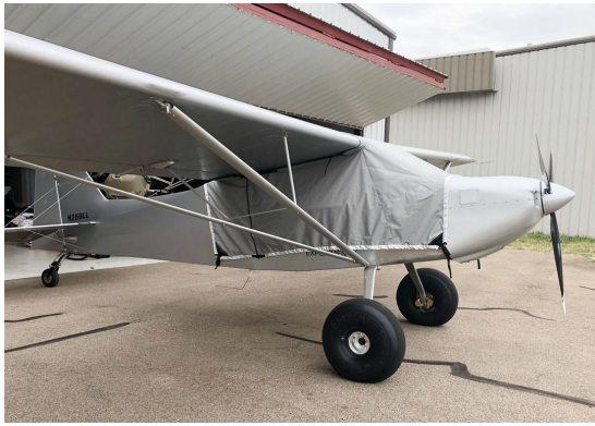
RANS S20 TRAVEL COVER