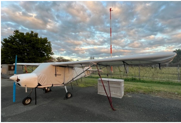
Best Off Skyranger Canopy & Wing Covers