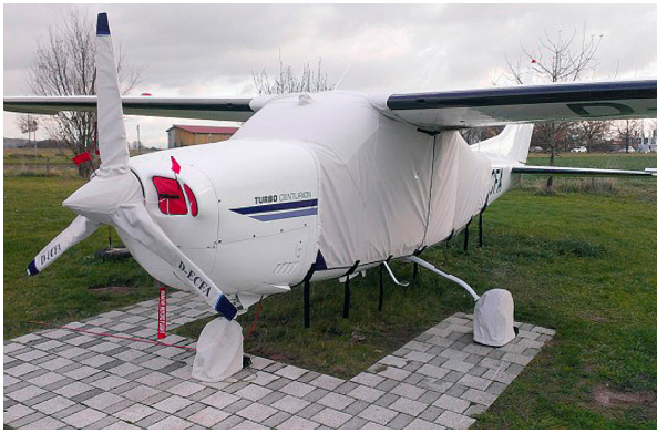
Cessna 210 Extended Canopy Cover, Engine Plugs, Prop and Tire Covers