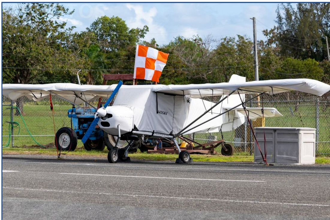
Best Off Skyranger Canopy, Wings &amp; Empennage Covers