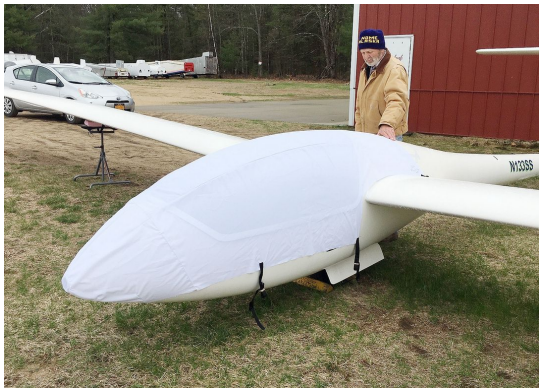
Grob 102 Astir CS Canopy/Nose Cover (test fit)