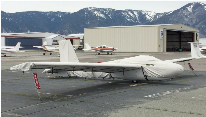
Schweizer SGS 1-26B Cover Set

the hottest of days. It is water, ice and snow repellent, yet breathable to allow moisture to escape from between the cover and the aircraft surface.