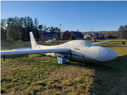
Schweizer 2-32 Full Cover Set

WINTER USE MATERIAL - Made with Solution-Dyed Polyester fabric, this option is intended for seasonal use to aid in deicing, rain mitigation, or for occasional travel. The material is lighter and more compact, but more susceptible to UV damage and may have a shorter useful life if used continuously outside than the all-year use material.