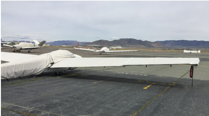
Schweizer SGS 1-26B Cover Set