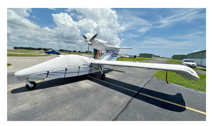
Seawind Seawind 300C & 3000 Amphibian Wing Covers, All Year Use