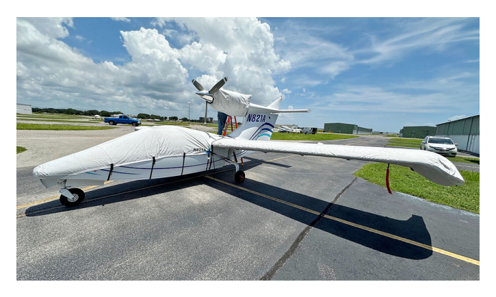
Seawind 3000 Canopy/Nose, Wing & Engine Covers

Seawind Seawind 300C & 3000 Engine Cover