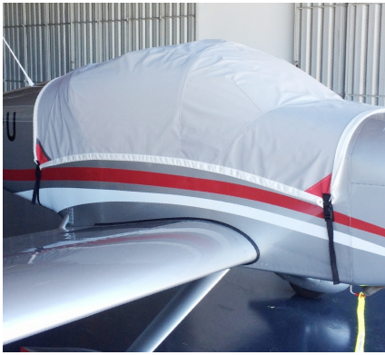
Vans's RV-9 Light Weight Travel Canopy Cover