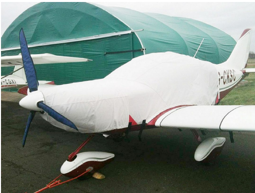
PiperSport Canopy/Engine Cover, Wing Locker Covers

This cover type is made from Silver Acrylic Sunbrella canvas and is 100% lined with a soft and smooth microfiber. Bruce's Custom Covers developed this material combination especially for aircraft protection. The outer material is medium weight and treated for water resistance, UV resistance and anti-static buildup. The inner lining is a very soft and smooth microfiber to prevent scratching. The material is very reflective, and tests show that the cabin interior temperature can be reduced to near-ambient temperature on the hottest of days. It is water, ice and snow repellent, yet breathable to allow moisture to escape from between the cover and the aircraft surface.