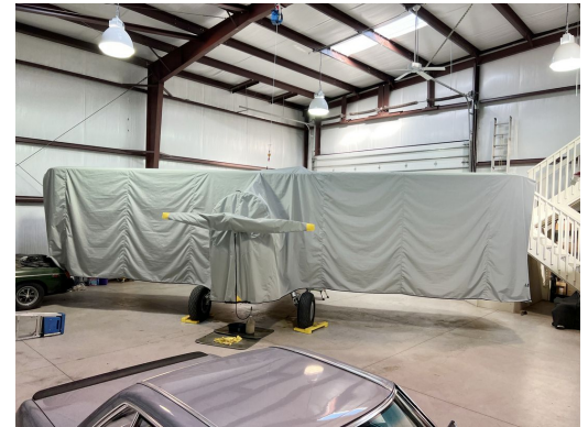
Stearman PT-13 Full Body Dust Cover