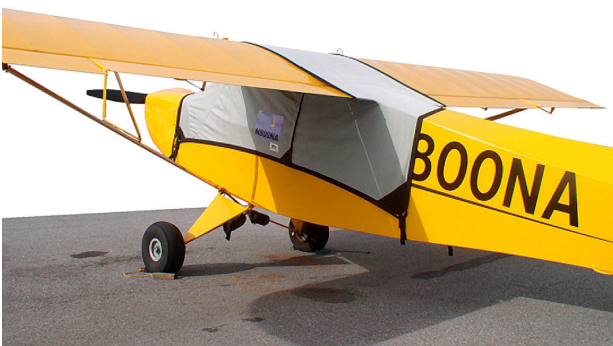
Zlin Savage Over-Top Canopy Cover