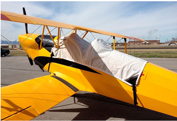
Bucker Jungmann Canopy Cover