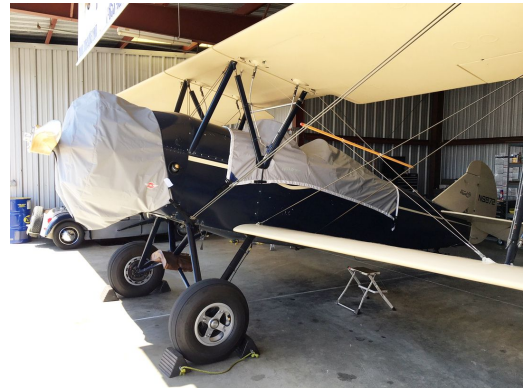
Travel Air 4000 Canopy and Engine Covers, light weight travel type