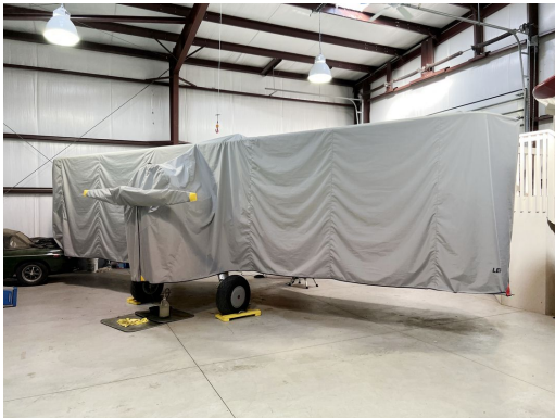
Stearman PT-13 Full Body Dust Cover, Prop Cover Included

Some high value aircraft end up logging lots of hangar time, and become dust magnets in the process. A high quality, well fitting dust cover provides easy assurance that the aircraft's surfaces remain clean and free of grit and grime. Available in a large variety of colors, each dust cover is custom made according to aircraft details and customer preferences. Fire retardant fabrics are also available.