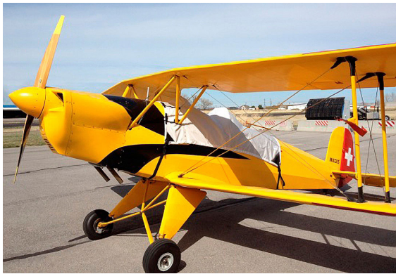
Bucker Jungmann Canopy Cover

the hottest of days. It is water, ice and snow repellent, yet breathable to allow moisture to escape from between the cover and the aircraft surface.