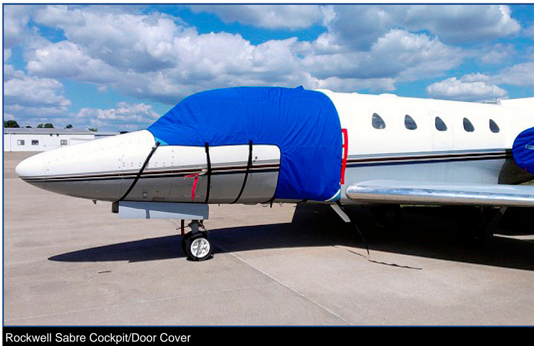
Rockwell Sabre Cockpit/Door Cover