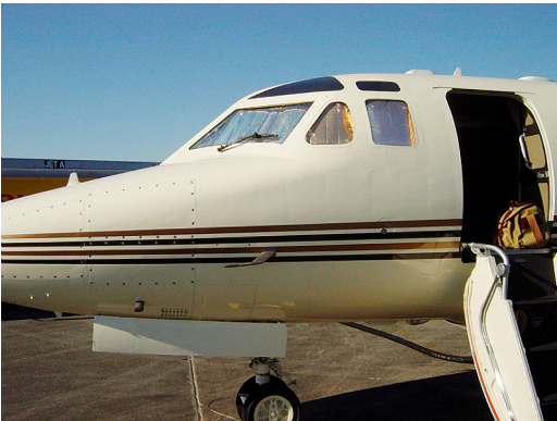
Sabre Cockpit HeatShields Set

Heatshields are interior sunshades for an aircraft's windows or canopy glass. The product is a unique composite of closed-cell foam with a silver mylar finish. The semi-rigid design is stiff enough to stand along the inside of the windshield using sun visors or window framing. It folds up flat and easily stores in the included storage sleeve. Some designs may require velcro and suction cups. A Heatshield is an excellent short-term remedy for cockpit overheating.