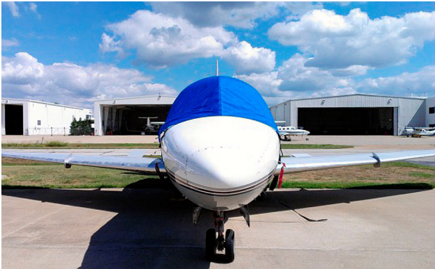
Rockwell Sabre Cockpit/Door Cover