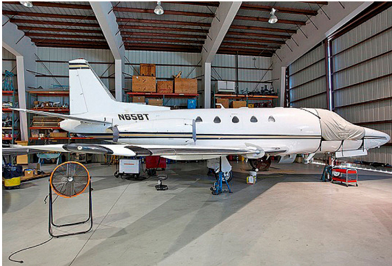
Sabre 40 Cockpit Cover

This cover type is made from Silver Acrylic Sunbrella canvas and is 100% lined with a soft and smooth microfiber. Bruce's Custom Covers developed this material combination especially for aircraft protection. The outer material is medium weight and treated for water resistance, UV resistance and anti-static buildup. The inner lining is a very soft and smooth microfiber to prevent scratching. The material is very reflective, and tests show that the cabin interior temperature can be reduced to near-ambient temperature on the hottest of days. It is water, ice and snow repellent, yet breathable to allow moisture to escape from between the cover and the aircraft surface.