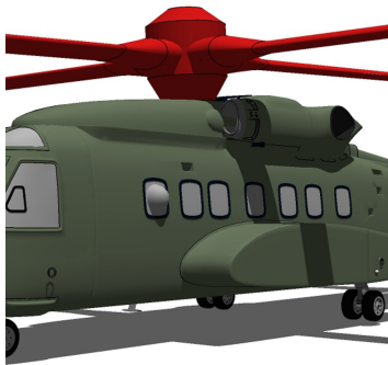
Sikorsky S-92 Main Rotor Hub Cover

shorter useful life if used continuously outside than the all-year use material.