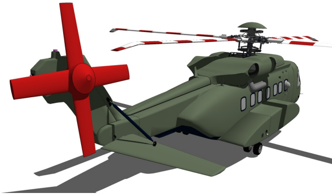
Sikorsky S-92 Tail Rotor Blade and Hub Covers