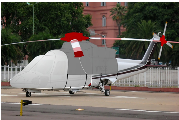
S76 Forward Fuselage, Engine, Main & Tail Rotor Hub Covers (illustration)