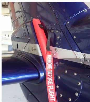
S76 Tail Wedge Plug

The Engine Inlet Plugs are custom fit for your Sikorsky S76 (All Models) intakes, made with heavy-duty vinyl material, and stuffed with a single block of sculpted urethane foam. Each plug has a zipper that allows the foam to be removed and dried if necessary. Engine plugs have 'Remove Before Flight' streamers sewn onto the face of the plugs. Most plugs are imprinted with the aircraft registration number in black for an extra charge. Storage bag NOT included. Engine plugs may be inserted after flight when the engine is still warm. Engine Inlet Plugs are commonly referred to as Cowl Plugs, Intake Plugs, Cowl Blocks, Engine Blocks, and Engine Bungs.