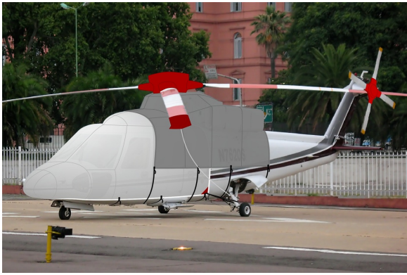
S76 Forward Fuselage, Engine, Main & Tail Rotor Hub Covers (illustration)