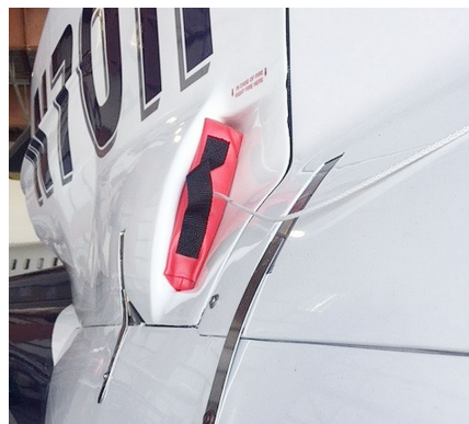
Sikorsky S76 (All Models) Intake Plugs (S76c Models)