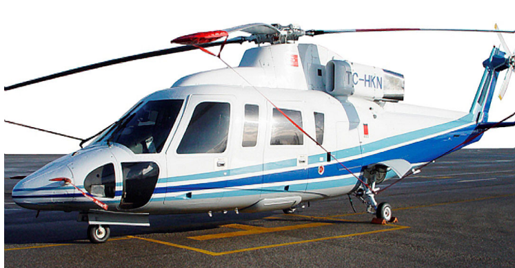
S76 Blade Tie-Downs and Pitot Cover set

WINTER USE MATERIAL - Made with Solution-Dyed Polyester fabric, this option is intended for seasonal use to aid in deicing, rain mitigation, or for occasional travel. The material is lighter and more compact, but more susceptible to UV damage and may have a shorter useful life if used continuously outside than the all-year use material.