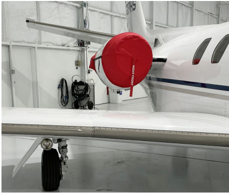
Cessna Citation S550 Intake/Exhaust Covers

and dried if necessary. Engine plugs have 'remove before flight' streamers sewn onto the face of the plugs. Most plugs are imprinted with the aircraft registration number in black. Engine plugs may be inserted after flight when the engine is still warm. Engine Inlet Plugs are commonly referred to as Cowl Plugs, Intake Plugs, Cowl Blocks, Engine Blocks, and Engine Bungs.