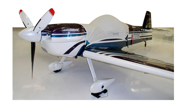
Cap 232 Canopy Cover