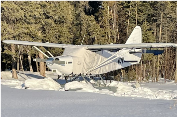
Stinson 108 Extended Canopy Cover, Wing Covers