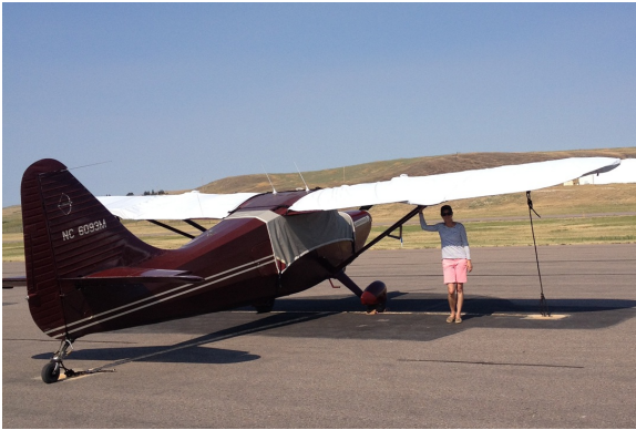
Stinson 108 Canopy Cover & Wing Covers