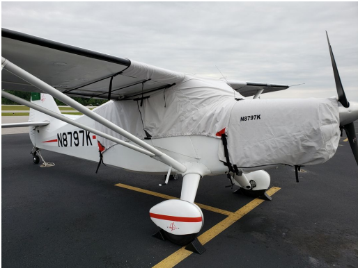
Stinson 108 Voyager Canopy Cover with wing extensions, Engine Cover

This cover type is made from Silver Acrylic Sunbrella canvas and is 100% lined with a soft and smooth microfiber. Bruce's Custom Covers developed this material combination especially for aircraft protection. The outer material is medium weight and treated for water resistance, UV resistance and anti-static buildup. The inner lining is a very soft and smooth microfiber to prevent scratching. The material is very reflective, and tests show that the cabin interior temperature can be reduced to near-ambient temperature on the hottest of days. It is water, ice and snow repellent, yet breathable to allow moisture to escape from between the cover and the aircraft surface.