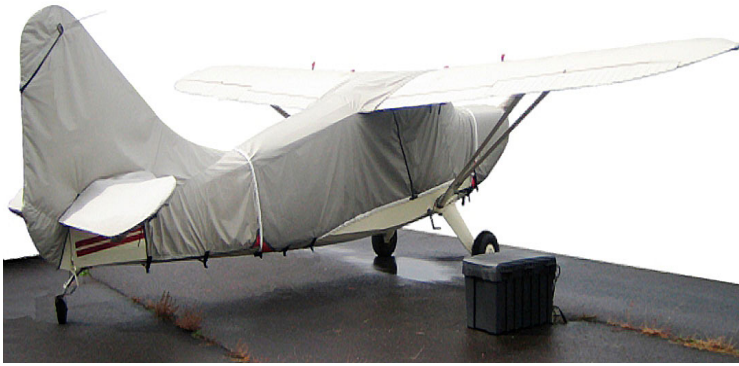
Stinson 108 Canopy, Engine, Prop & Empennage Covers