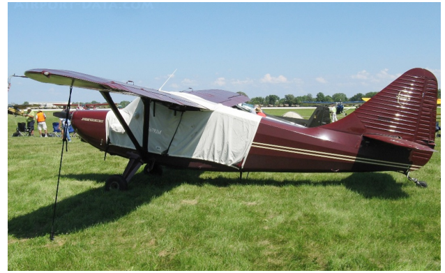
Stinson 108 Extended Over-Top Canopy Cover