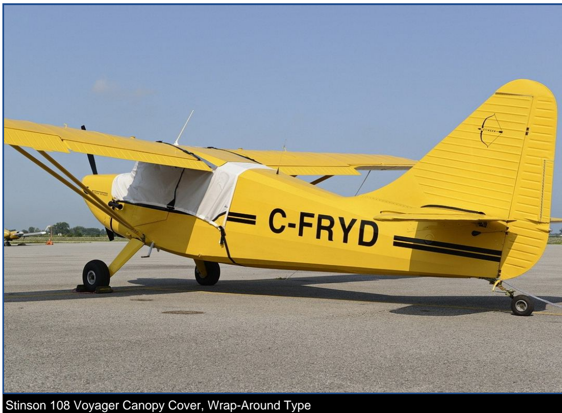
Stinson 108 Voyager Canopy Cover, Wrap-Around Type