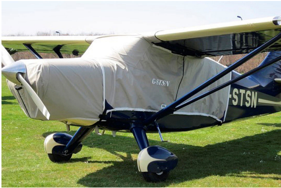
Stinson 108 Canopy & Engine Cover

This cover type is made from Silver Acrylic Sunbrella canvas and is 100% lined with a soft and smooth microfiber. Bruce's Custom Covers developed this material combination especially for aircraft protection. The outer material is medium weight and treated for water resistance, UV resistance and anti-static buildup. The inner lining is a very soft and smooth microfiber to prevent scratching. The material is very reflective, and tests show that the cabin interior temperature can be reduced to near-ambient temperature on the hottest of days. It is water, ice and snow repellent, yet breathable to allow moisture to escape from between the cover and the aircraft surface.