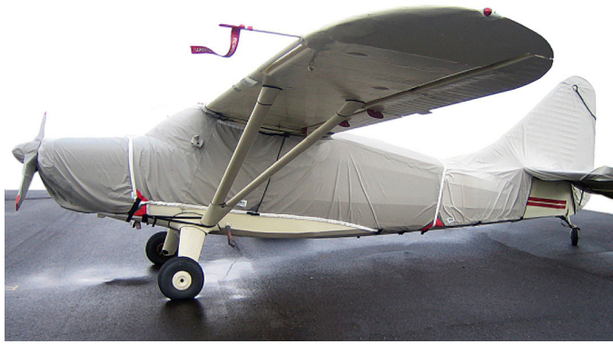
Stinson 108 Canopy, Engine, Prop & Empennage Covers