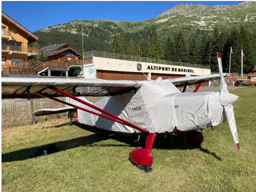
Stinson 108-3 Voyager Cover Set

WINTER USE MATERIAL - Made with Solution-Dyed Polyester fabric, this option is intended for seasonal use to aid in deicing, rain mitigation, or for occasional travel. The material is lighter and more compact, but more susceptible to UV damage and may have a shorter useful life if used continuously outside than the all-year use material.