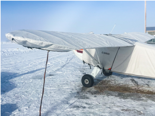
Stinson 108 Winter Cover Set