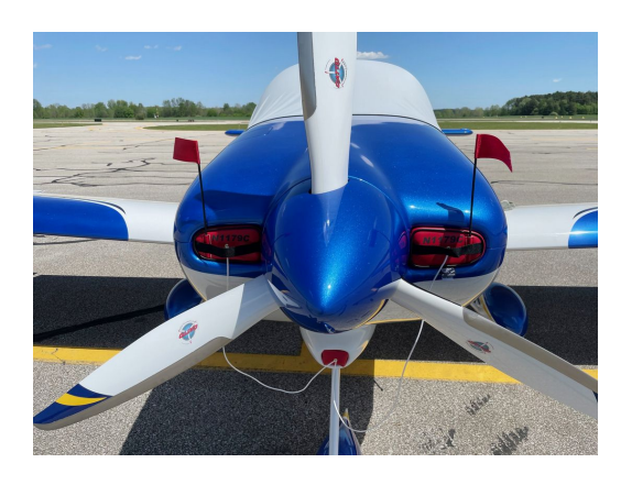
Van's Aircraft RV-9/9A Engine Inlet Plugs