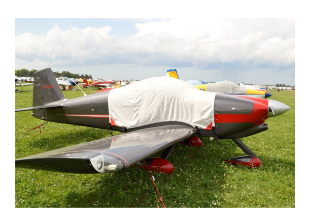
Van's RV-7A Extended Canopy Cover