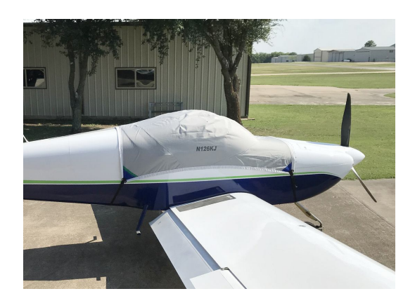
Van's RV-9A Travel Weight Canopy Cover

occasional use outside. We also have an ultra lightweight material available for fitted hangar dust covers. For daily outdoor use, the non-travel Sunbrella Cover is the best choice.