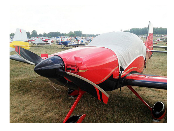
Van's RV-7 Canopy Cover & Engine Inlet Plugs