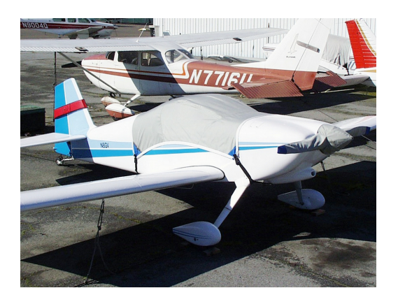
Vans's RV-6 Canopy Cover, Prop Cover