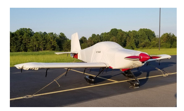
Van's RV-7A Complete Cover Set

This cover type is made from Silver Acrylic Sunbrella canvas and is 100% lined with a soft and smooth microfiber. Bruce's Custom Covers developed this material combination especially for aircraft protection. The outer material is medium weight and treated for water resistance, UV resistance and anti-static buildup. The inner lining is a very soft and smooth microfiber to prevent scratching. The material is very reflective, and tests show that the cabin interior temperature can be reduced to near-ambient temperature on the hottest of days. It is water, ice and snow repellent, yet breathable to allow moisture to escape from between the cover and the aircraft surface.