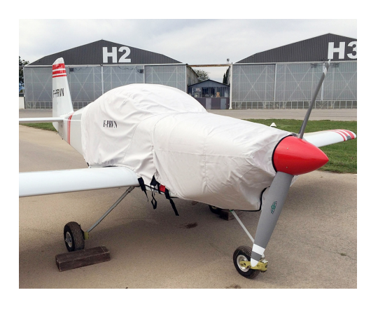
Van's Aircraft RV-9/9A Engine Cover