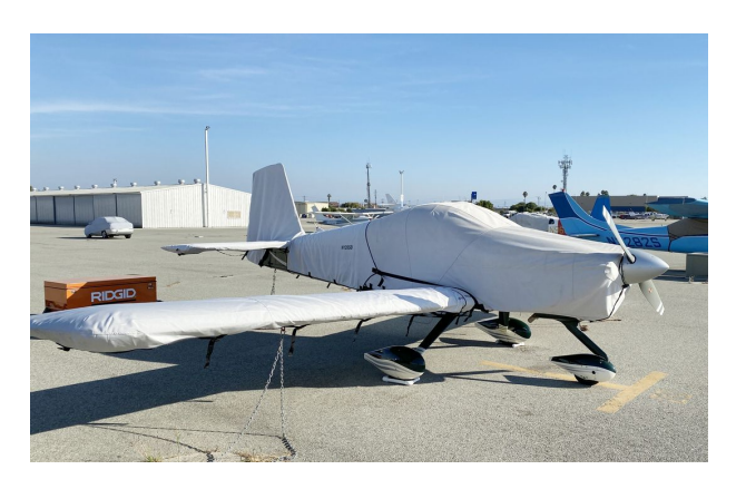
Van's RV-9A Extended Canopy/Engine, Wing & Empennage Covers