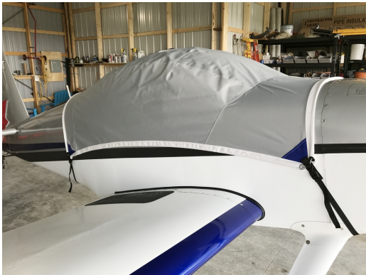
Van's Aircraft RV-9 Travel Cover, Light Weight Travel Canopy Cover