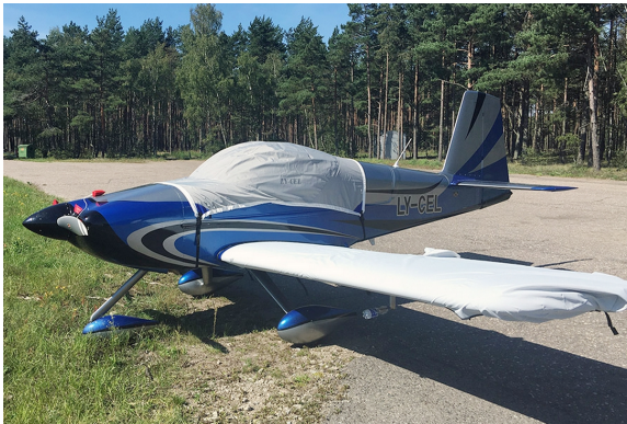
Van's RV-7/7A Travel and Wing Covers