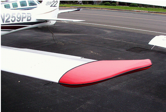
Cirrus SR-22 Wingtip Pad (also available for the Horiz. Stab.