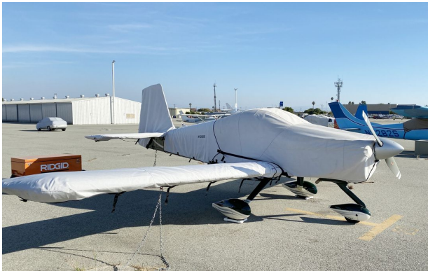
Van's RV-9A Extended Canopy/Engine, Wing & Empennage Covers

WINTER USE MATERIAL - Made with Solution-Dyed Polyester fabric, this option is intended for seasonal use to aid in deicing, rain mitigation, or for occasional travel. The material is lighter and more compact, but more susceptible to UV damage and may have a shorter useful life if used continuously outside than the all-year use material.