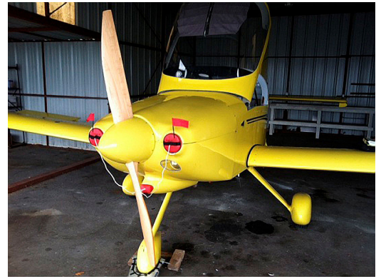
Van's RV-9A Engine Inlet Plugs