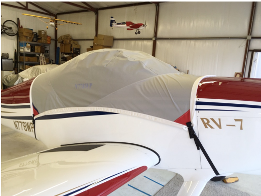
Van's RV-7 Travel Canopy Cover

Travel Covers are made with Silver Solution-Dyed Polyester fabric and only lined over the windshield to save weight. The material is lightweight and more compact for easy stowage in the aircraft. The polyester material is water resistant, but only intended for occasional use outside. We also have an ultra lightweight material available for fitted hangar dust covers. For daily outdoor use, the non-travel Sunbrella Cover is the best choice.