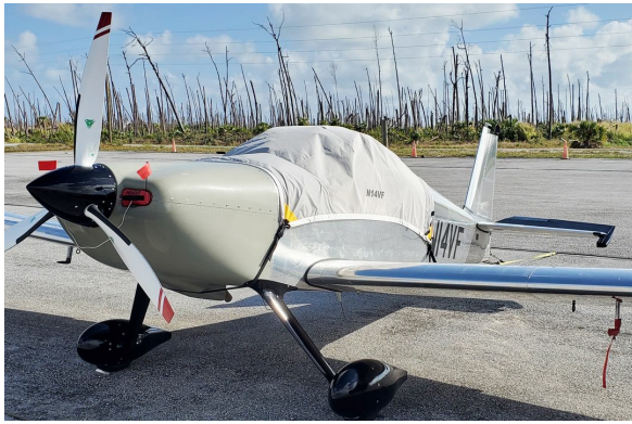
Van's RV-7 Canopy Cover, Engine Plugs