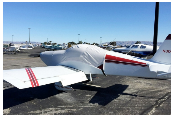
Van's RV-6A Canopy/Engine Cover