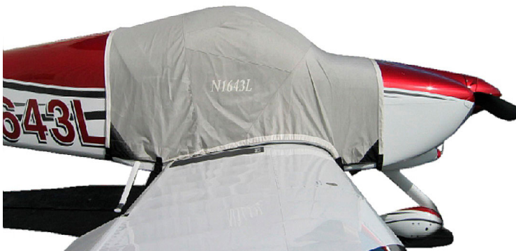
Van's RV-7A Extended Canopy Cover

This cover type is made from Silver Acrylic Sunbrella canvas and is 100% lined with a soft and smooth microfiber. Bruce's Custom Covers developed this material combination especially for aircraft protection. The outer material is medium weight and treated for water resistance, UV resistance and anti-static buildup. The inner lining is a very soft and smooth microfiber to prevent scratching. The material is very reflective, and tests show that the cabin interior temperature can be reduced to near-ambient temperature on the hottest of days. It is water, ice and snow repellent, yet breathable to allow moisture to escape from between the cover and the aircraft surface.