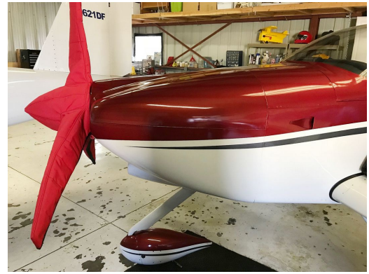
Van's RV-9 Insulated Prop Cover, 3-blade