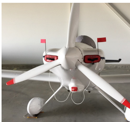
Van's RV-4 Engine Inlet Plugs

Engine Inlet Plugs are custom fit for your Van's Aircraft RV-4 intakes, made with heavy-duty vinyl material, and stuffed with a single block of sculpted urethane foam. Each plug has a zipper that allows the foam to be removed and dried if necessary. Engine plugs have warning flags that are visible from the cockpit or 'remove before flight' streamers sewn onto the face of the plugs. Most plugs are imprinted with the aircraft registration number in black for an extra charge. Storage bag NOT included. Engine plugs may be inserted after flight when the engine is still warm. Engine Inlet Plugs are commonly referred to as Cowl Plugs, Intake Plugs, Cowl Blocks, Engine Blocks, and Engine Bungs.