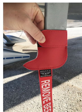
Van's RV-4 Custom Pitot Tube