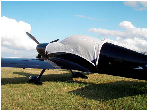
Harmon Rocket Canopy Cover