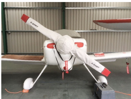
Van's RV-6 Prop/Spinner Cover

This cover type is made from Silver Acrylic Sunbrella canvas and is 100% lined with a soft and smooth microfiber. Bruce's Custom Covers developed this material combination especially for aircraft protection. The outer material is medium weight and treated for water resistance, UV resistance and anti-static buildup. The inner lining is a very soft and smooth microfiber to prevent scratching. The material is very reflective, and tests show that the cabin interior temperature can be reduced to near-ambient temperature on the hottest of days. It is water, ice and snow repellent, yet breathable to allow moisture to escape from between the cover and the aircraft surface.