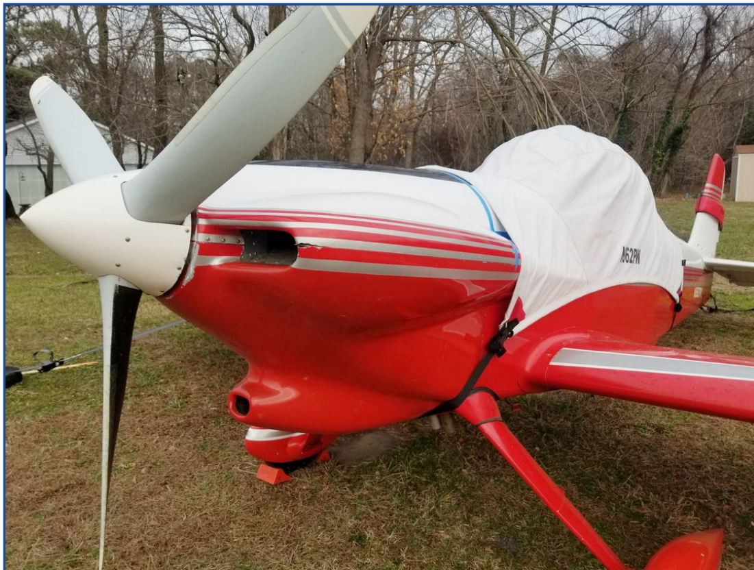
Vans RV-4 Canopy Cover