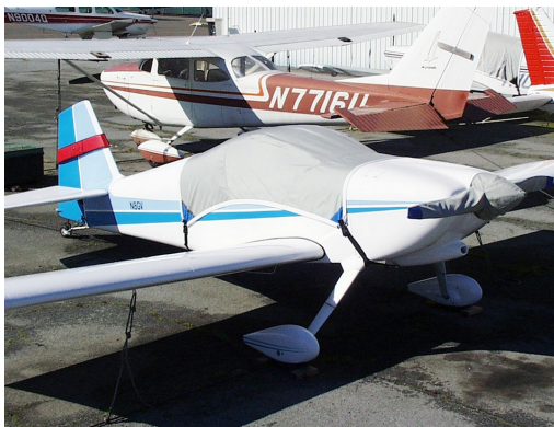
Vans's RV-6 Canopy Cover, Prop Cover