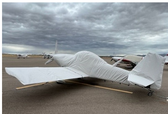
Vans RV-8 Complete Cover Set