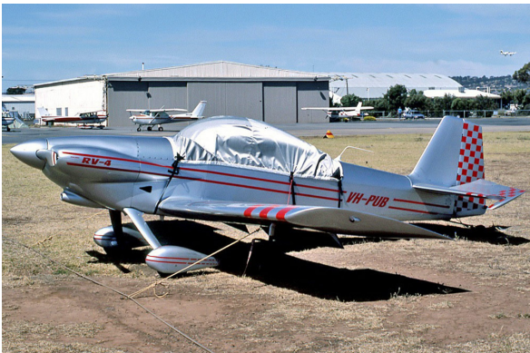
Vans's RV-4 Canopy Cover