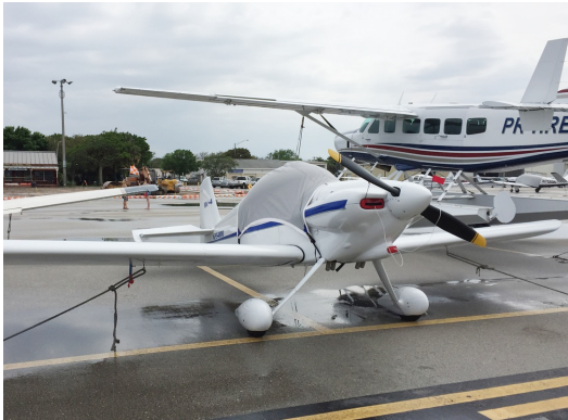
Van's RV-4/Harmon Rocket Travel Cover

Travel Covers are made with Silver Solution-Dyed Polyester fabric and only lined over the windshield to save weight. The material is lightweight and more compact for easy stowage in the aircraft. The polyester material is water resistant, but only intended for occasional use outside. We also have an ultra lightweight material available for fitted hangar dust covers. For daily outdoor use, the non-travel Sunbrella Cover is the best choice.