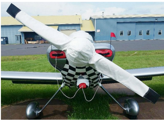
Van's RV-3 Engine Plugs, Prop/Spinner Cover