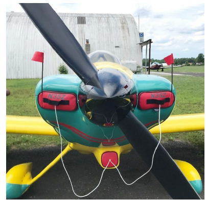
Van's Aircraft RV-4 Engine Inlet Plugs