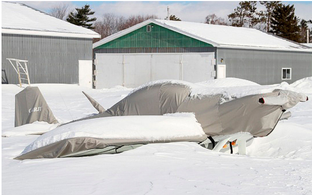
Van's RV-4 Complete Fuselage Cover