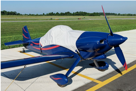
Van's RV-3 Canopy Cover

This cover type is made from Silver Acrylic Sunbrella canvas and is 100% lined with a soft and smooth microfiber. Bruce's Custom Covers developed this material combination especially for aircraft protection. The outer material is medium weight and treated for water resistance, UV resistance and anti-static buildup. The inner lining is a very soft and smooth microfiber to prevent scratching. The material is very reflective, and tests show that the cabin interior temperature can be reduced to near-ambient temperature on the hottest of days. It is water, ice and snow repellent, yet breathable to allow moisture to escape from between the cover and the aircraft surface.