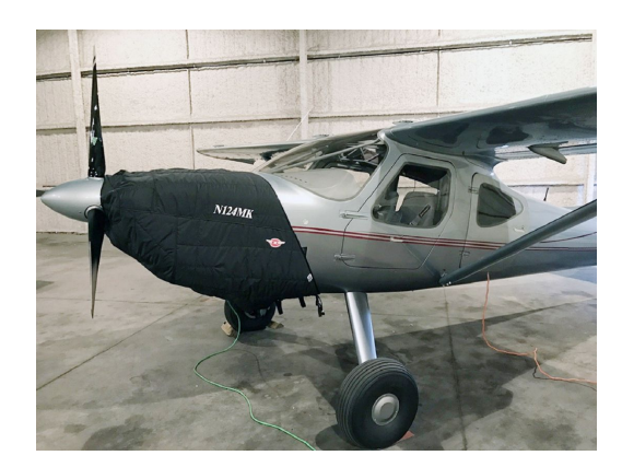
OMF Symphony Canopy, Wings, Horiz. Stab, and Prop Covers Glasair Aviation Glastar, Sportsman 2+2 Insulated Engine Cover