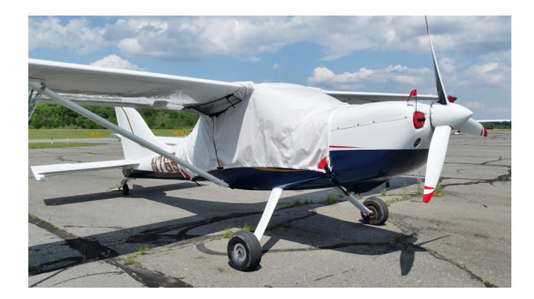
Glastar Over-Top Canopy Cover, Engine Plugs

Travel Covers are made with Silver Solution-Dyed Polyester fabric and only lined over the windshield to save weight. The material is lightweight and more compact for easy stowage in the aircraft. The polyester material is water resistant, but only intended for occasional use outside. We also have an ultra lightweight material available for fitted hangar dust covers. For daily outdoor use, the non-travel Sunbrella Cover is the best choice.