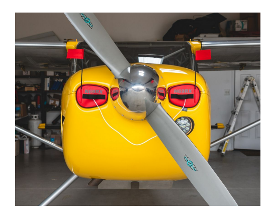
Glastar Engine Inlet Plugs