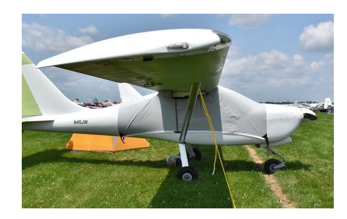
Glastar Travel Cover