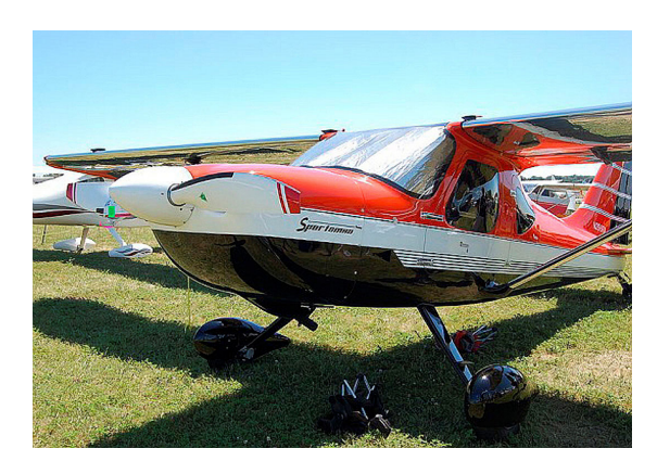
Glastar Sportsman Windshield HeatShield

Windshield Heatshields are interior sunshades for an aircraft's front windshield. The product is a unique composite of closed-cell foam with a silver mylar finish. The semi-rigid design is stiff enough to stand along the inside of the windshield using sun visors or window framing. It folds up flat and easily stores in the included storage sleeve. Some designs may require velcro and suction cups or split right and left sides. A Heatshield is an excellent short-term remedy for cockpit overheating. An external fabric cover is far more effective and practical for long-term protection.