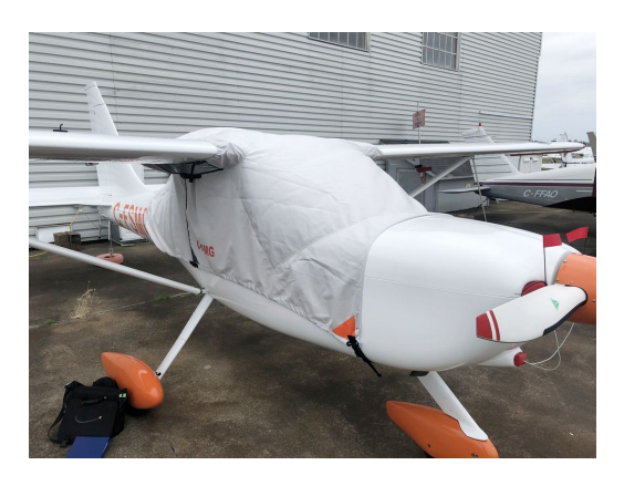
Glastar Canopy Cover, Engine Plugs

Engine Inlet Plugs are custom fit for your Van's Aircraft RV-15 intakes, made with heavy-duty vinyl material, and stuffed with a single block of sculpted urethane foam. Each plug has a zipper that allows the foam to be removed and dried if necessary. Engine plugs have warning flags that are visible from the cockpit or 'remove before flight' streamers sewn onto the face of the plugs. Most plugs are imprinted with the aircraft registration number in black for an extra charge. Storage bag NOT included. Engine plugs may be inserted after flight when the engine is still warm. Engine Inlet Plugs are commonly referred to as Cowl Plugs, Intake Plugs, Cowl Blocks, Engine Blocks, and Engine Bungs.