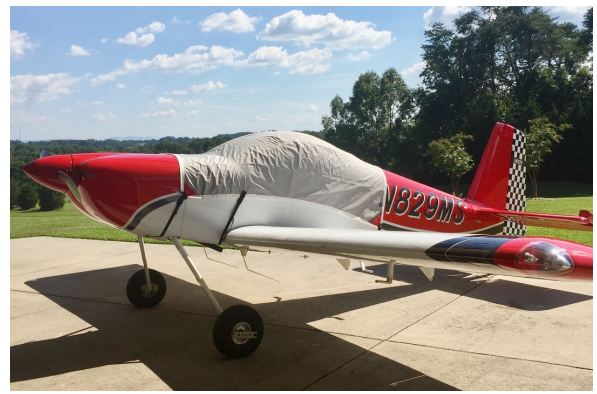
Van's Aircraft RV-14 Travel Cover