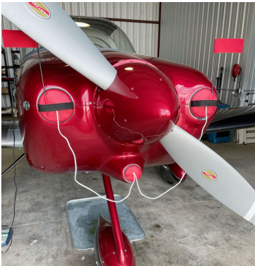
RV-14A Engine Inlet Plugs, Sam James Cowl