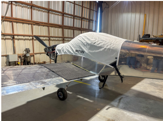
Van's RV-14A Canopy Cover