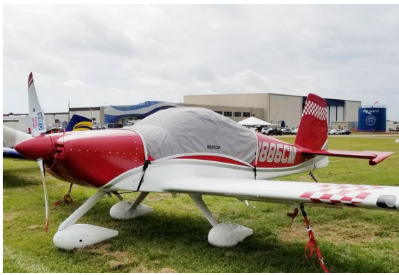
Van's RV-14 Travel Canopy Cover