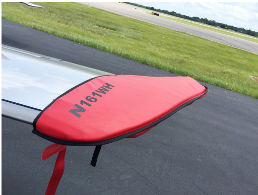
Cirrus SR-20/22 Wingtip Pads

Designed to prevent damage to the aircraft extremities in crowded hangars, these products are made of bright red Naugahyde and thickly padded with a sandwich of closed cell foam.