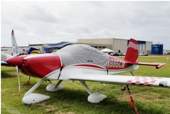
Van's RV-14 Travel Canopy Cover

Engine Inlet Plugs are custom fit for your Van's Aircraft RV-14 intakes, made with heavy-duty vinyl material, and stuffed with a single block of sculpted urethane foam. Each plug has a zipper that allows the foam to be removed and dried if necessary. Engine plugs have warning flags that are visible from the cockpit or 'remove before flight' streamers sewn onto the face of the plugs. Most plugs are imprinted with the aircraft registration number in black for an extra charge. Storage bag NOT included. Engine plugs may be inserted after flight when the engine is still warm. Engine Inlet Plugs are commonly referred to as Cowl Plugs, Intake Plugs, Cowl Blocks, Engine Blocks, and Engine Bungs.