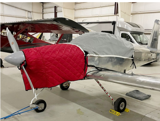
Vans RV-7 Travel Canopy Cover, Hangar Blanket

This cover type is made from Silver Acrylic Sunbrella canvas and is 100% lined with a soft and smooth microfiber. Bruce's Custom Covers developed this material combination especially for aircraft protection. The outer material is medium weight and treated for water resistance, UV resistance and anti-static buildup. The inner lining is a very soft and smooth microfiber to prevent scratching. The material is very reflective, and tests show that the cabin interior temperature can be reduced to near-ambient temperature on the hottest of days. It is water, ice and snow repellent, yet breathable to allow moisture to escape from between the cover and the aircraft surface.