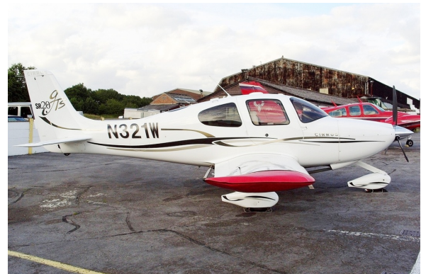
Cirrus SR-20/22 Wingtip Pads