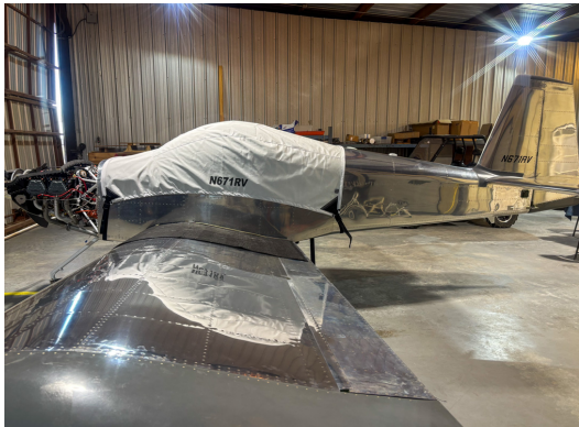
Van's RV-14A Canopy Cover

This cover type is made from Silver Acrylic Sunbrella canvas and is 100% lined with a soft and smooth microfiber. Bruce's Custom Covers developed this material combination especially for aircraft protection. The outer material is medium weight and treated for water resistance, UV resistance and anti-static buildup. The inner lining is a very soft and smooth microfiber to prevent scratching. The material is very reflective, and tests show that the cabin interior temperature can be reduced to near-ambient temperature on the hottest of days. It is water, ice and snow repellent, yet breathable to allow moisture to escape from between the cover and the aircraft surface.