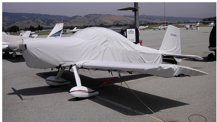
Van's RV-8 Complete Fuselage Cover w/ Detachable Wing Covers & Prop Cover