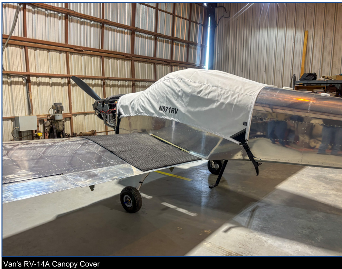
Van's RV-14A Canopy Cover