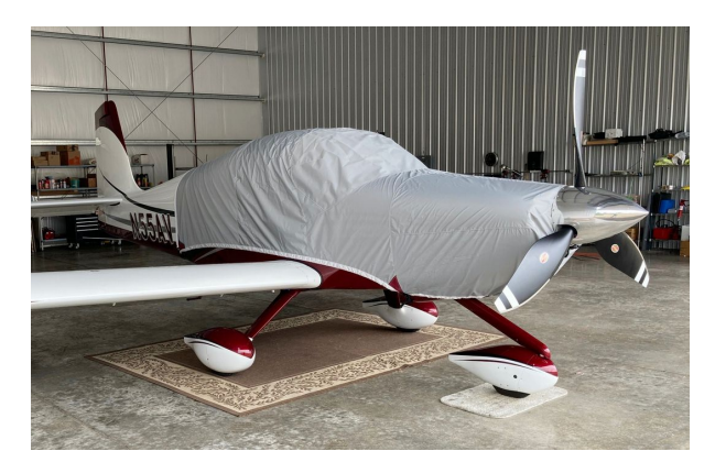
Van's RV-10 Travel Cover

Travel Covers are made with Silver Solution-Dyed Polyester fabric and only lined over the windshield to save weight. The material is lightweight and more compact for easy stowage in the aircraft. The polyester material is water resistant, but only intended for occasional use outside. We also have an ultra lightweight material available for fitted hangar dust covers. For daily outdoor use, the non-travel Sunbrella Cover is the best choice.