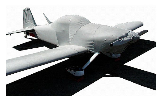
Van's RV-4 Complete Cover