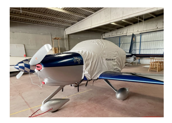
Van's RV-10 Extended Canopy Cover, Engine Plugs

Engine Inlet Plugs are custom fit for your Van's Aircraft RV-10 intakes, made with heavy-duty vinyl material, and stuffed with a single block of sculpted urethane foam. Each plug has a zipper that allows the foam to be removed and dried if necessary. Engine plugs have warning flags that are visible from the cockpit or 'remove before flight' streamers sewn onto the face of the plugs. Most plugs are imprinted with the aircraft registration number in black for an extra charge. Storage bag NOT included. Engine plugs may be inserted after flight when the engine is still warm. Engine Inlet Plugs are commonly referred to as Cowl Plugs, Intake Plugs, Cowl Blocks, Engine Blocks, and Engine Bungs.