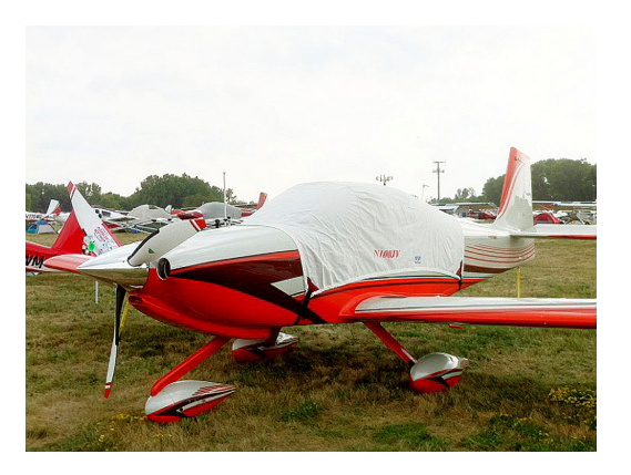
Van's RV-10 Canopy Cover