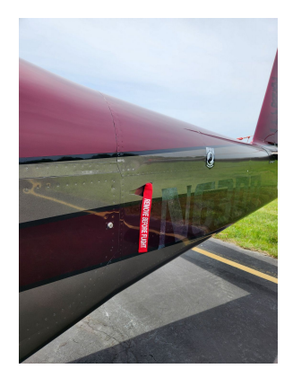
RV-10 Air Vent Wedge Plugs