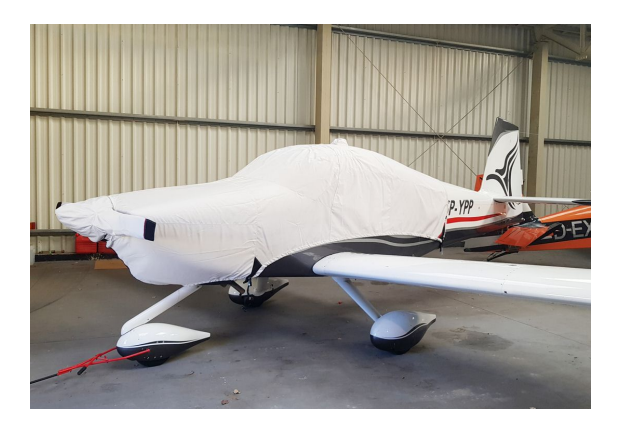
Van's RV-10 Propellor/Spinner Cover

This cover type is made from Silver Acrylic Sunbrella canvas and is 100% lined with a soft and smooth microfiber. Bruce's Custom Covers developed this material combination especially for aircraft protection. The outer material is medium weight and treated for water resistance, UV resistance and anti-static buildup. The inner lining is a very soft and smooth microfiber to prevent scratching. The material is very reflective, and tests show that the cabin interior temperature can be reduced to near-ambient temperature on the hottest of days. It is water, ice and snow repellent, yet breathable to allow moisture to escape from between the cover and the aircraft surface.