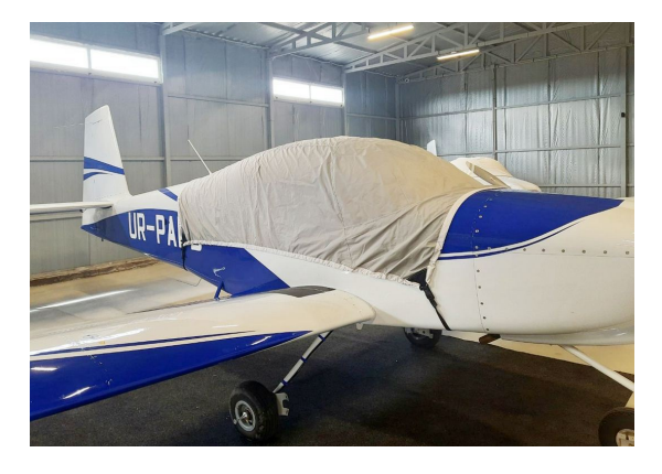
Van's RV-10 Travel Weight Canopy Cover