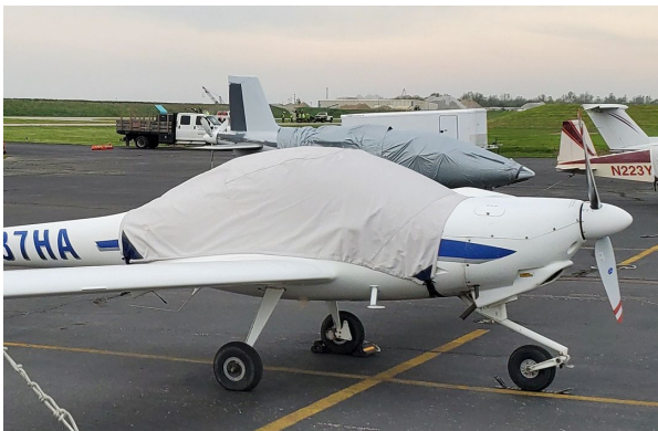
Diamond DA-20 Katana

This cover type is made from Silver Acrylic Sunbrella canvas and is 100% lined with a soft and smooth microfiber. Bruce's Custom Covers developed this material combination especially for aircraft protection. The outer material is medium weight and treated for water resistance, UV resistance and anti-static buildup. The inner lining is a very soft and smooth microfiber to prevent scratching. The material is very reflective, and tests show that the cabin interior temperature can be reduced to near-ambient temperature on the hottest of days. It is water, ice and snow repellent, yet breathable to allow moisture to escape from between the cover and the aircraft surface.