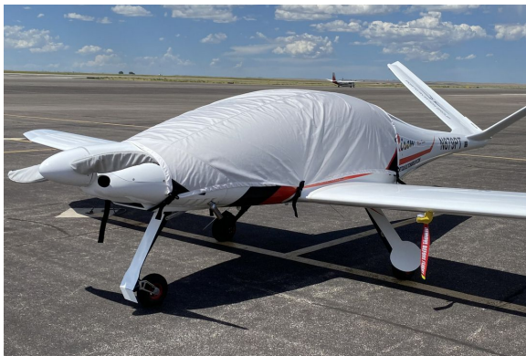
Swiss Excellence Risen 914 Canopy Cover