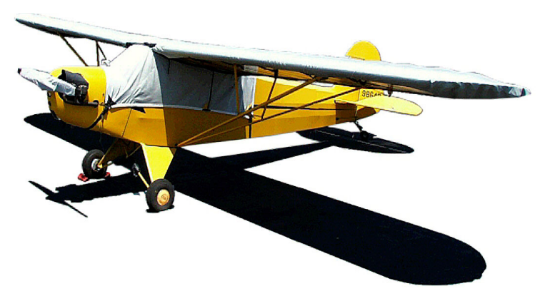
Piper J3 Canopy, Wing and Prop Covers

This cover type is made from Silver Acrylic Sunbrella canvas and is 100% lined with a soft and smooth microfiber. Bruce's Custom Covers developed this material combination especially for aircraft protection. The outer material is medium weight and treated for water resistance, UV resistance and anti-static buildup. The inner lining is a very soft and smooth microfiber to prevent scratching. The material is very reflective, and tests show that the cabin interior temperature can be reduced to near-ambient temperature on the hottest of days. It is water, ice and snow repellent, yet breathable to allow moisture to escape from between the cover and the aircraft surface.