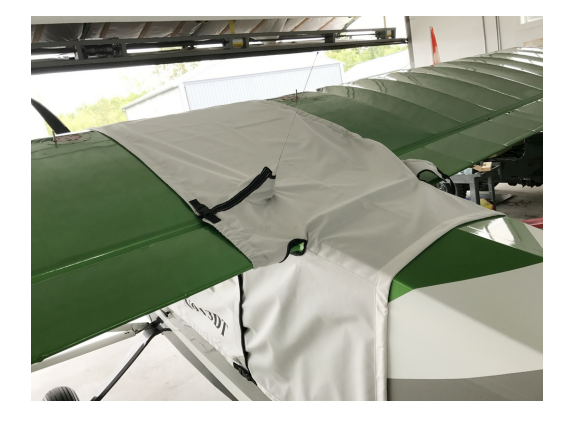
Rans S-7 Courier Canopy Cover (Over-The-Top Style), Belly Strap Type, Lsa Model (S7-S)