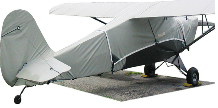
Taylorcraft L-2 Grasshopper Prop, Engine, Canopy, Wing and Empennage Covers