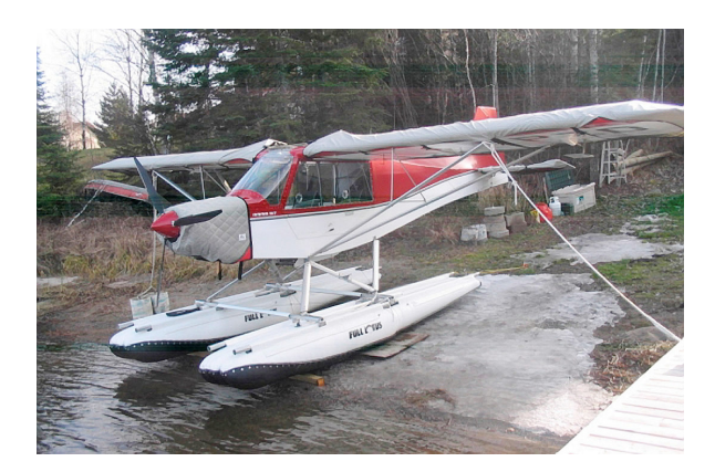
FOR INTERIOR USE. Cub Crafters CC-11 Insulated Hangar Blanket, Rans S-7 Insulated Engine, Wing and Horizontal Stabilizer available in Red or Silver Covers