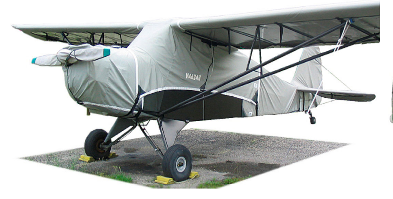
Prop Cover, Engine Cover, Canopy Cover, Wing Covers and Empennage Cover

WINTER USE MATERIAL - Made with Solution-Dyed Polyester fabric, this option is intended for seasonal use to aid in deicing, rain mitigation, or for occasional travel. The material is lighter and more compact, but more susceptible to UV damage and may have a shorter useful life if used continuously outside than the all-year use material.