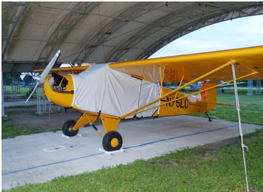
Piper J-3 Extended Canopy Cover

This cover type is made from Silver Acrylic Sunbrella canvas and is 100% lined with a soft and smooth microfiber. Bruce's Custom Covers developed this material combination especially for aircraft protection. The outer material is medium weight and treated for water resistance, UV resistance and anti-static buildup. The inner lining is a very soft and smooth microfiber to prevent scratching. The material is very reflective, and tests show that the cabin interior temperature can be reduced to near-ambient temperature on the hottest of days. It is water, ice and snow repellent, yet breathable to allow moisture to escape from between the cover and the aircraft surface.