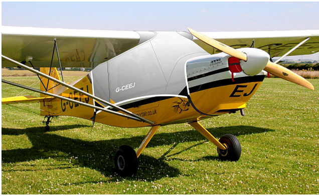
Rans Canopy Cover & Engine Plugs (illustration on a Rans S-7)