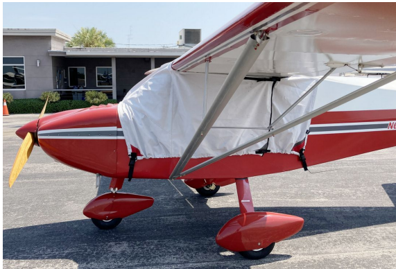
Rans S-6 Canopy Cover