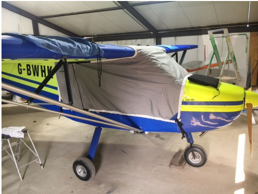
Rans S-6 Coyote Light Weight Travel Canopy Cover

Travel Covers are made with Silver Solution-Dyed Polyester fabric and only lined over the windshield to save weight. The material is lightweight and more compact for easy stowage in the aircraft. The polyester material is water resistant, but only intended for occasional use outside. We also have an ultra lightweight material available for fitted hangar dust covers. For daily outdoor use, the non-travel Sunbrella Cover is the best choice.