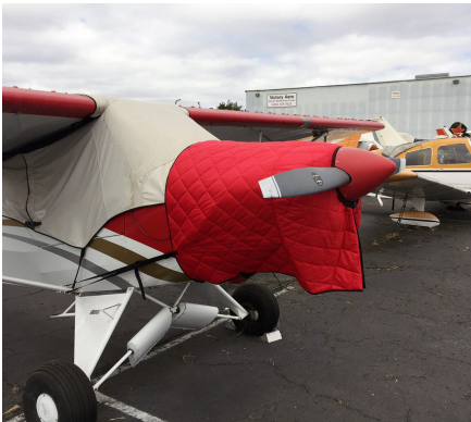
FOR INTERIOR USE. Cub Crafters CC-11 Insulated Hangar Blanket, available in Red or Silver FOR INTERIOR USE. Cub Crafters CC-11 Insulated Hangar Blanket, available in Red or Silver