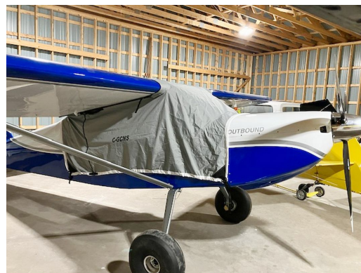
Rans S-21 Travel Weight Canopy Cover