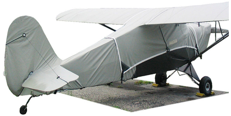
Taylorcraft L-2 Grasshopper Prop, Engine, Canopy, Wing and Empennage Covers