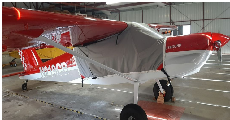
RANS S-21 Travel Weight Canopy Cover

Travel Covers are made with Silver Solution-Dyed Polyester fabric and only lined over the windshield to save weight. The material is lightweight and more compact for easy stowage in the aircraft. The polyester material is water resistant, but only intended for occasional use outside. We also have an ultra lightweight material available for fitted hangar dust covers. For daily outdoor use, the non-travel Sunbrella Cover is the best choice.