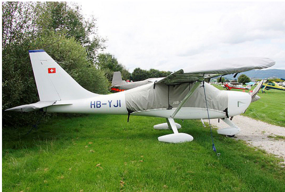
Glaster Canopy, Wings, Horizontal Stab. & Prop Covers