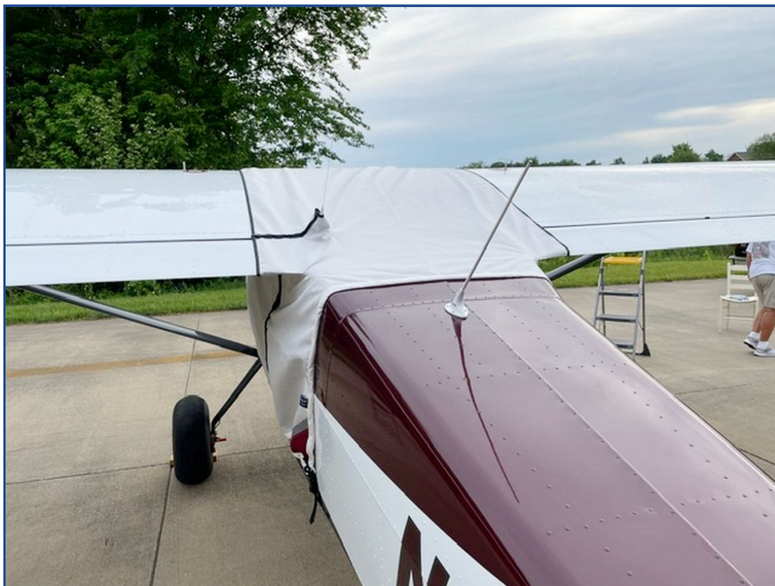
Rans S-21 Outbound Canopy Cover