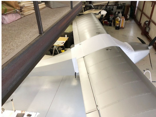
Rans S-20 Canopy Cover, test fit cover