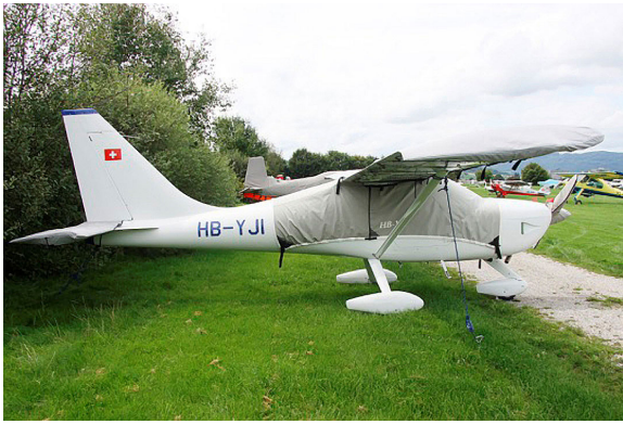
Glstar Canopy, Wings, Horizontal Stab. & Prop Covers