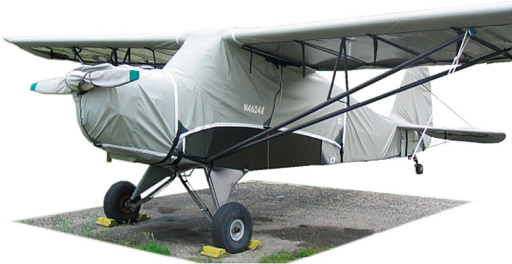
Prop Cover, Engine Cover, Canopy Cover, Wing Covers and Empennage Cover

WINTER USE MATERIAL - Made with Solution-Dyed Polyester fabric, this option is intended for seasonal use to aid in deicing, rain mitigation, or for occasional travel. The material is lighter and more compact, but more susceptible to UV damage and may have a shorter useful life if used continuously outside than the all-year use material.