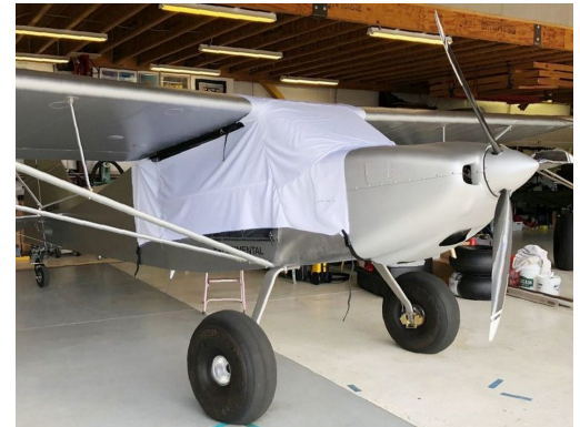
Rans S-20 Canopy Cover, test fit cover