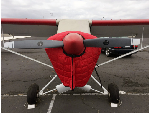
FOR INTERIOR USE. Cub Crafters CC-11 Insulated Hangar Blanket, available in Red or Silver