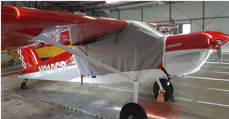
RANS S-21 Travel Weight Canopy Cover

Travel Covers are made with Silver Solution-Dyed Polyester fabric and only lined over the windshield to save weight. The material is lightweight and more compact for easy stowage in the aircraft. The polyester material is water resistant, but only intended for occasional use outside. We also have an ultra lightweight material available for fitted hangar dust covers. For daily outdoor use, the non-travel Sunbrella Cover is the best choice.