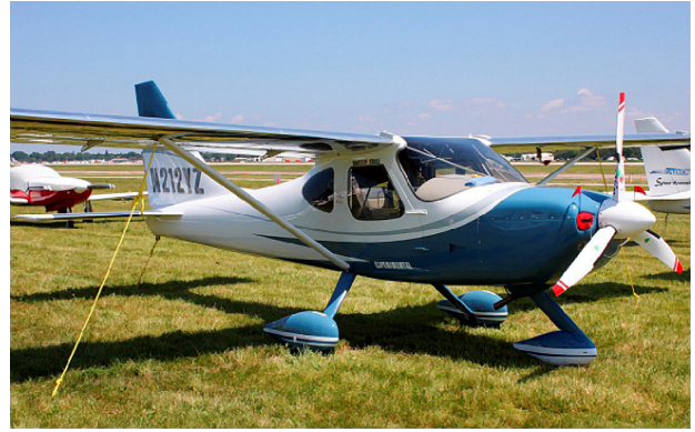
Glastar Sportsman Engine Inlet Plugs