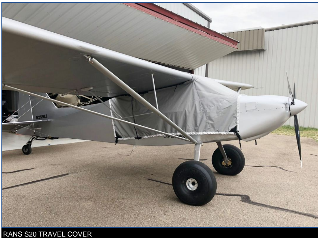
RANS S20 TRAVEL COVER