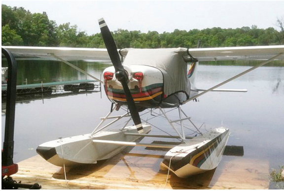
Glastar Sportsman Canopy Cover and Engine Plugs