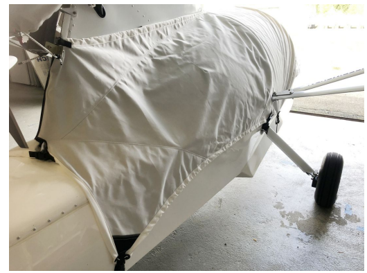
Searey Canopy/Nose Cover