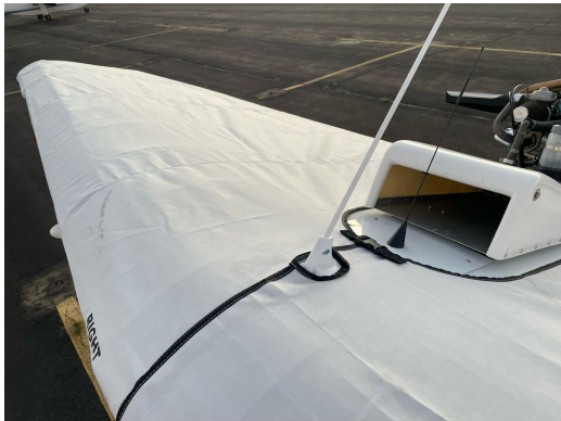
SeaRey Wing Covers

WINTER USE MATERIAL - Made with Solution-Dyed Polyester fabric, this option is intended for seasonal use to aid in deicing, rain mitigation, or for occasional travel. The material is lighter and more compact, but more susceptible to UV damage and may have a shorter useful life if used continuously outside than the all-year use material.