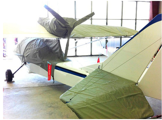
SeaRey Canopy, Engine, Wing & Horizontal Stab. (test fit covers)