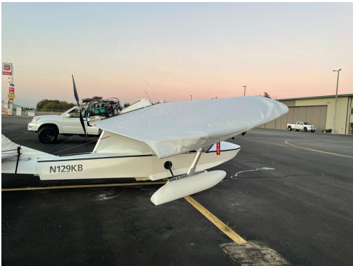
SeaRey Wing Covers