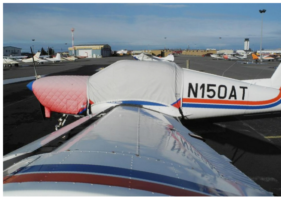
Koliber 150A Canopy Cover, Insulated Engine Cover