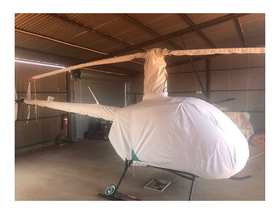
Robinson R-22 Full Cover Set