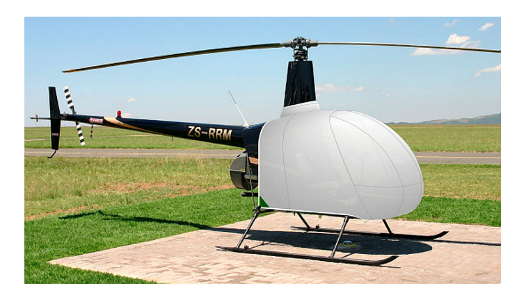
Robinson R-22 Extended Canopy Cover (illustration)