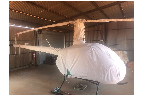
Robinson R-22 Bubble Cover (Ext. Past Rotor Hub), Engine Cover, Tailboom Cover, Blade Covers, Rotor Hub Cover, & Tail Rotor Gear Box Cover