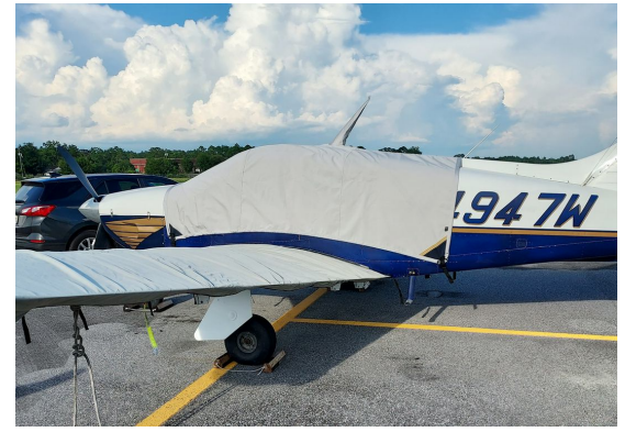
Rockwell 114 Canopy Cover & Wing Covers