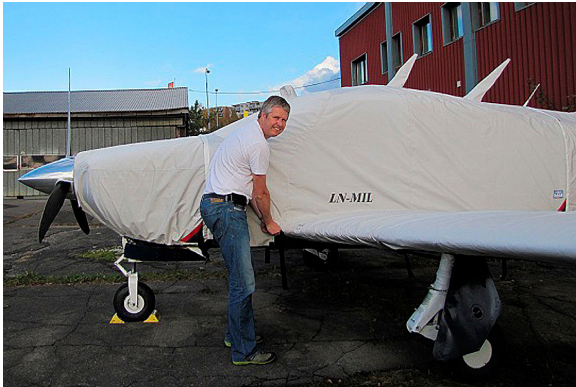
Rockwell Commander 114 Full Cover Set

This cover type is made from Silver Acrylic Sunbrella canvas and is 100% lined with a soft and smooth microfiber. Bruce's Custom Covers developed this material combination especially for aircraft protection. The outer material is medium weight and treated for water resistance, UV resistance and anti-static buildup. The inner lining is a very soft and smooth microfiber to prevent scratching. The material is very reflective, and tests show that the cabin interior temperature can be reduced to near-ambient temperature on the hottest of days. It is water, ice and snow repellent, yet breathable to allow moisture to escape from between the cover and the aircraft surface.