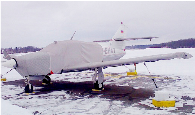
Rockwell Commander Extended Canopy Cover, Insulated Engine Cover, Wing & Tail Covers