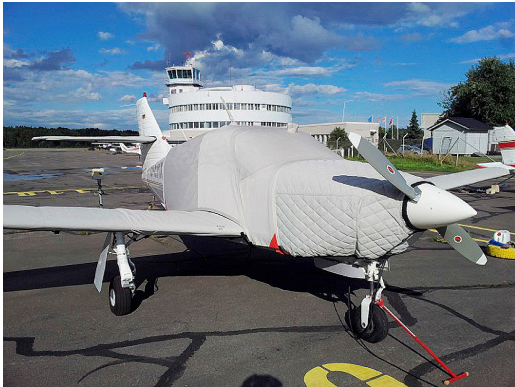
Rockwell Commander 114 Extended Canopy, Insulated Engine, Wing Covers