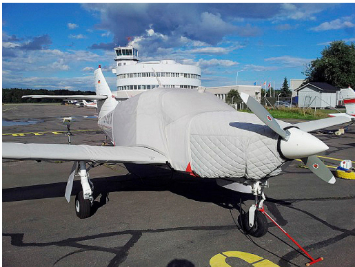
Rockwell Commander 114 Extended Canopy, Insulated Engine, Wing Covers

This cover type is made from Silver Acrylic Sunbrella canvas and is 100% lined with a soft and smooth microfiber. Bruce's Custom Covers developed this material combination especially for aircraft protection. The outer material is medium weight and treated for water resistance, UV resistance and anti-static buildup. The inner lining is a very soft and smooth microfiber to prevent scratching. The material is very reflective, and tests show that the cabin interior temperature can be reduced to near-ambient temperature on the hottest of days. It is water, ice and snow repellent, yet breathable to allow moisture to escape from between the cover and the aircraft surface.