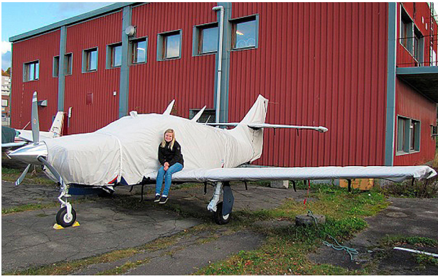
Rockwell Commander Engine, Extended Canopy, Wings, & Empennage Covers