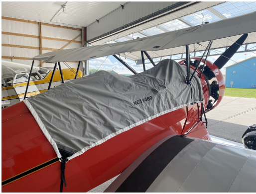
Waco QCF-2 Travel Weight Canopy Cover