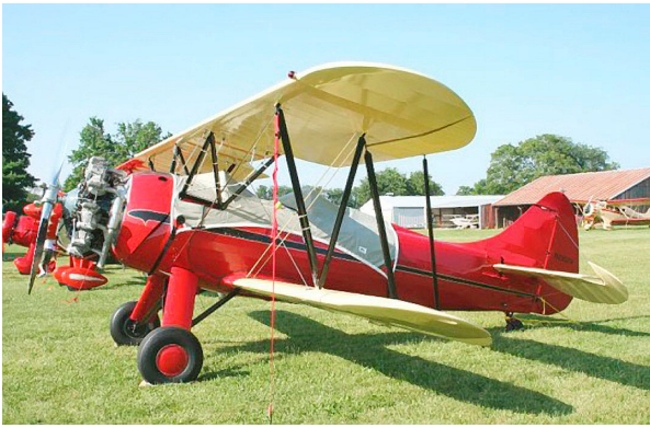
Waco YMF Canopy Cover