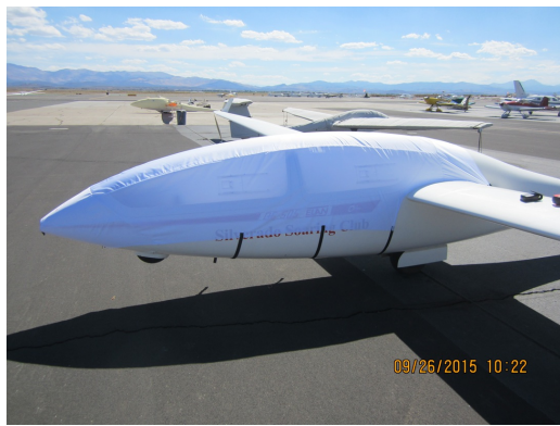
DG-505 Canopy/Nose Cover (test fit cover)