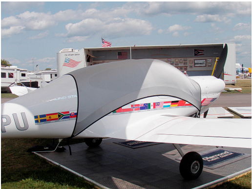
Diamond DA-40 Light Weight Travel Cover (Spandex Flyaway Type)

Travel Covers are made with Silver Solution-Dyed Polyester fabric and only lined over the windshield to save weight. The material is lightweight and more compact for easy stowage in the aircraft. The polyester material is water resistant, but only intended for occasional use outside. We also have an ultra lightweight material available for fitted hangar dust covers. For daily outdoor use, the non-travel Sunbrella Cover is the best choice.