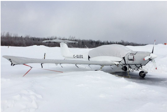
Diamond DA40 Canopy, Insulated Engine, Wing and Stab. Covers