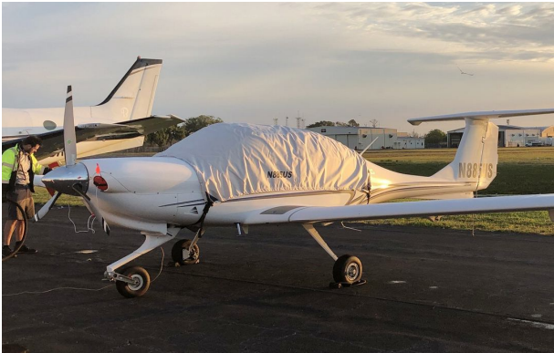
Diamond DA-40 Canopy Cover & Engine Plugs

Engine Inlet Plugs are custom fit for your Pipistrel Panthera intakes, made with heavy-duty vinyl material, and stuffed with a single block of sculpted urethane foam. Each plug has a zipper that allows the foam to be removed and dried if necessary. Engine plugs have warning flags that are visible from the cockpit or 'remove before flight' streamers sewn onto the face of the plugs. Most plugs are imprinted with the aircraft registration number in black for an extra charge. Storage bag NOT included. Engine plugs may be inserted after flight when the engine is still warm. Engine Inlet Plugs are commonly referred to as Cowl Plugs, Intake Plugs, Cowl Blocks, Engine Blocks, and Engine Bungs.