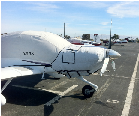
Diamond DA-40 Insulated Engine Cover, Silver/Grey

This cover type is made from Silver Acrylic Sunbrella canvas and is 100% lined with a soft and smooth microfiber. Bruce's Custom Covers developed this material combination especially for aircraft protection. The outer material is medium weight and treated for water resistance, UV resistance and anti-static buildup. The inner lining is a very soft and smooth microfiber to prevent scratching. The material is very reflective, and tests show that the cabin interior temperature can be reduced to near-ambient temperature on the hottest of days. It is water, ice and snow repellent, yet breathable to allow moisture to escape from between the cover and the aircraft surface.