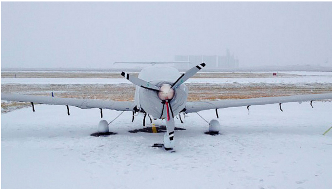
Diamond DA-40 Extended Canopy Cover, Wing Covers & Insulated Engine Cover

WINTER USE MATERIAL - Made with Solution-Dyed Polyester fabric, this option is intended for seasonal use to aid in deicing, rain mitigation, or for occasional travel. The material is lighter and more compact, but more susceptible to UV damage and may have a shorter useful life if used continuously outside than the all-year use material.