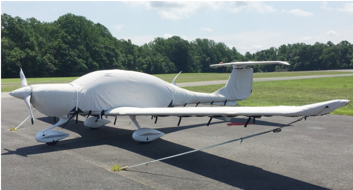
Diamond DA-40 Extended Canopy, Wing, Engine, Prop, Empennage & Horiz. Stab Covers