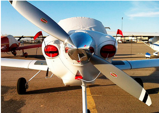
Diamond DA-40 Engine Inlet Plugs (set of 3)