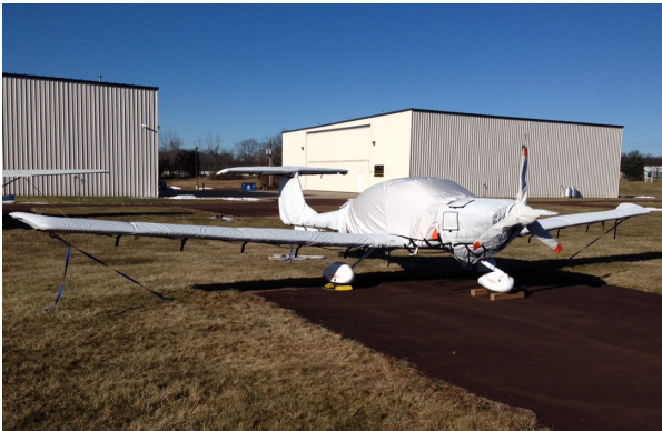
Diamond DA-40 Full Cover Set, with Insulated Engine Cover