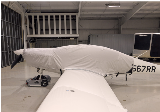
Pipistrel Panthera Extended Canopy/Engine Cover

This cover type is made from Silver Acrylic Sunbrella canvas and is 100% lined with a soft and smooth microfiber. Bruce's Custom Covers developed this material combination especially for aircraft protection. The outer material is medium weight and treated for water resistance, UV resistance and anti-static buildup. The inner lining is a very soft and smooth microfiber to prevent scratching. The material is very reflective, and tests show that the cabin interior temperature can be reduced to near-ambient temperature on the hottest of days. It is water, ice and snow repellent, yet breathable to allow moisture to escape from between the cover and the aircraft surface.