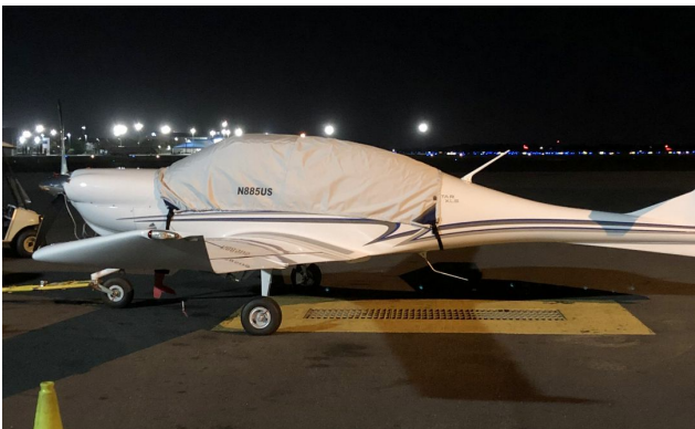
Diamond DA-40 Canopy Cover