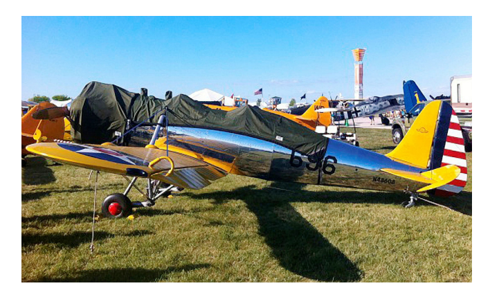
Ryan PT-22 ST3KR Canopy Cover and Engine Cover