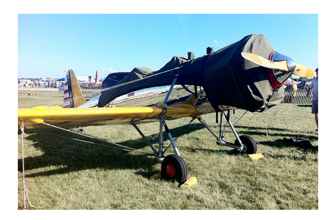
Ryan PT-22 Canopy Cover and Engine Cover

water resistance, UV resistance and anti-static buildup. The inner lining is a very soft and smooth microfiber to prevent scratching. The material is very reflective, and tests show that the cabin interior temperature can be reduced to near-ambient temperature on the hottest of days. It is water, ice and snow repellent, yet breathable to allow moisture to escape from between the cover and the aircraft surface.