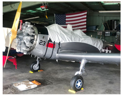
Fairchild PT-23 Canopy Cover