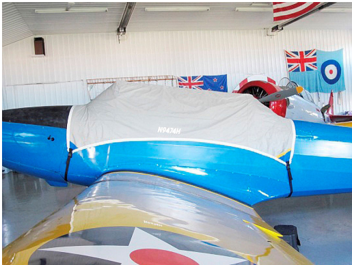
Fairchild PT-26 Canopy Cover