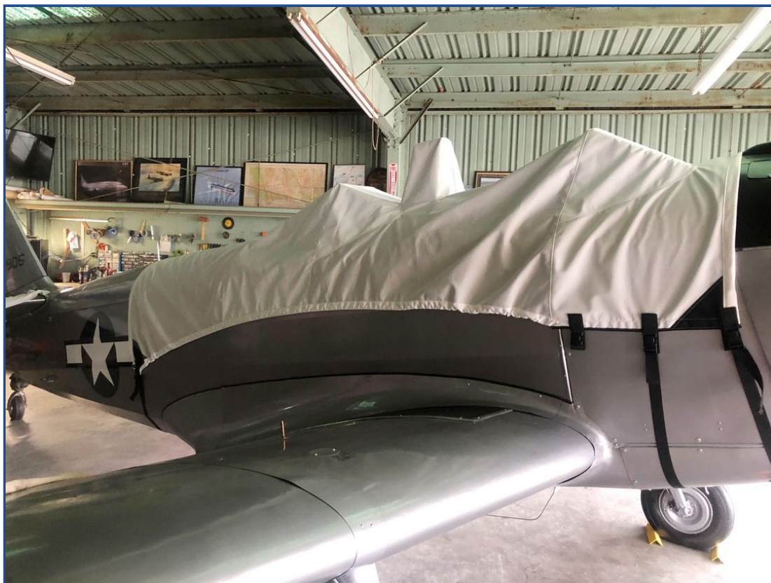
Fairchild PT-23 Canopy Cover