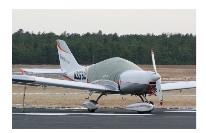
Czech Sport Cruiser Canopy Cover

This cover type is made from Silver Acrylic Sunbrella canvas and is 100% lined with a soft and smooth microfiber. Bruce's Custom Covers developed this material combination especially for aircraft protection. The outer material is medium weight and treated for water resistance, UV resistance and anti-static buildup. The inner lining is a very soft and smooth microfiber to prevent scratching. The material is very reflective, and tests show that the cabin interior temperature can be reduced to near-ambient temperature on the hottest of days. It is water, ice and snow repellent, yet breathable to allow moisture to escape from between the cover and the aircraft surface.