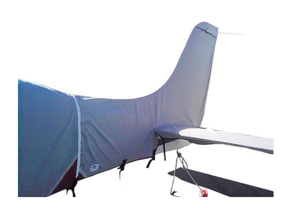
Cirrus SR20 Empennage Cover (covers tail boom, vertical and horizontal stabilizers)

WINTER USE MATERIAL - Made with Solution-Dyed Polyester fabric, this option is intended for seasonal use to aid in deicing, rain mitigation, or for occasional travel. The material is lighter and more compact, but more susceptible to UV damage and may have a shorter useful life if used continuously outside than the all-year use material.