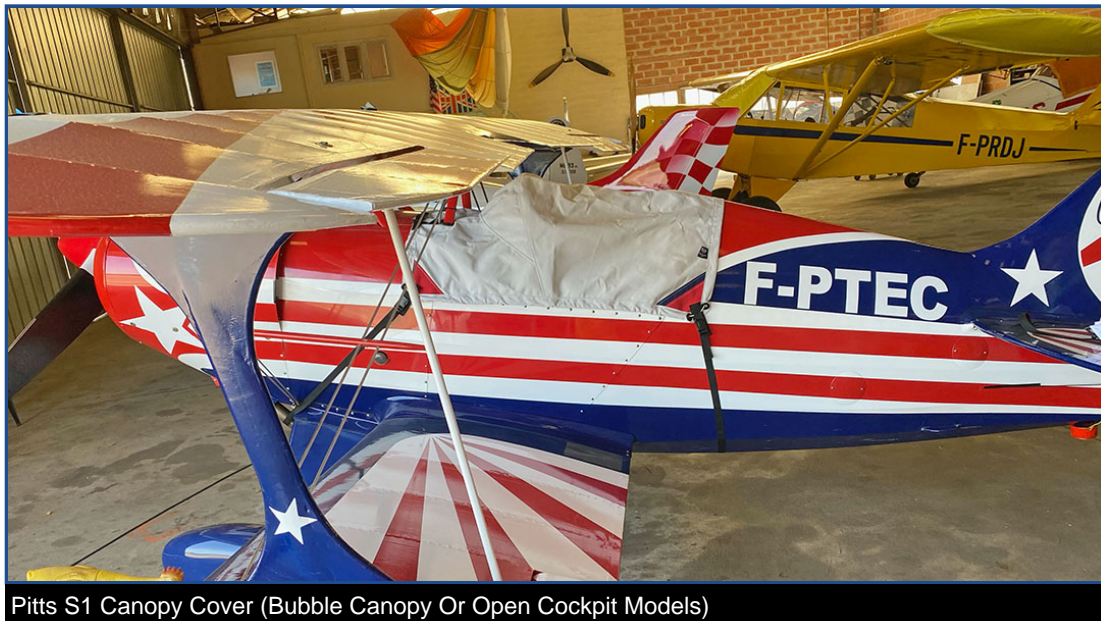
Pitts S1 Canopy Cover (Bubble Canopy Or Open Cockpit Models)