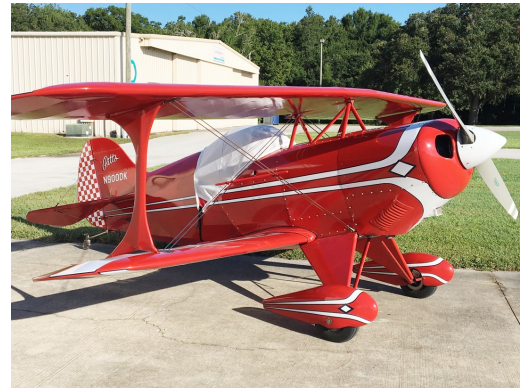
Pitts S1 Canopy Cover