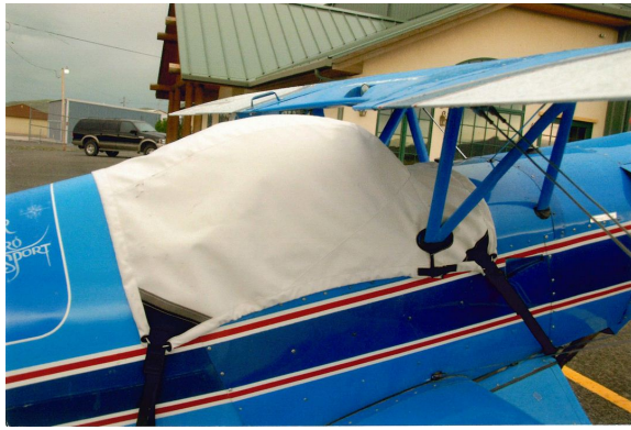
Acro Sport Canopy Cover