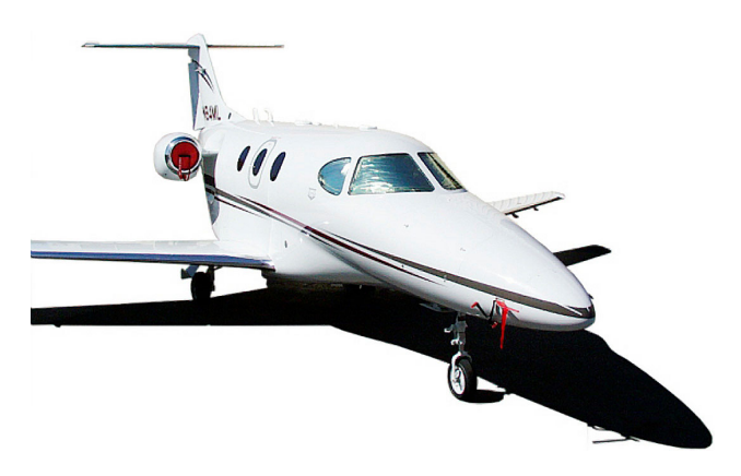
Raytheon Premier Intake Plugs, Pitot Covers & Cockpit HeatShields

Heatshield is an excellent short-term remedy for cockpit overheating, but an external fabric cover is more effective for long-term protection.