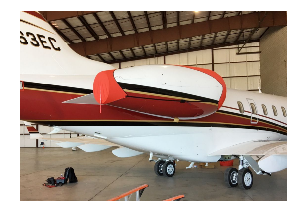
Premier Intake Plugs, Intake Covers, Pitot Covers & Cockpit HeatShields