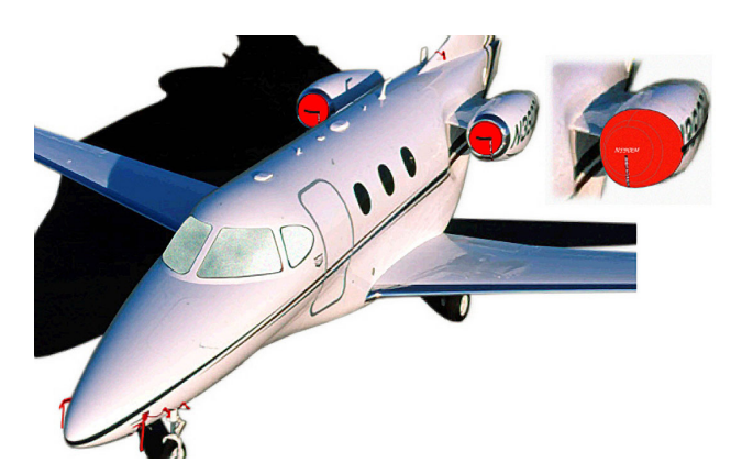
Premier Intake Plugs, Intake Covers, Pitot Covers & Cockpit HeatShields