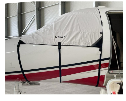
Hawker Premier Cockpit Cover