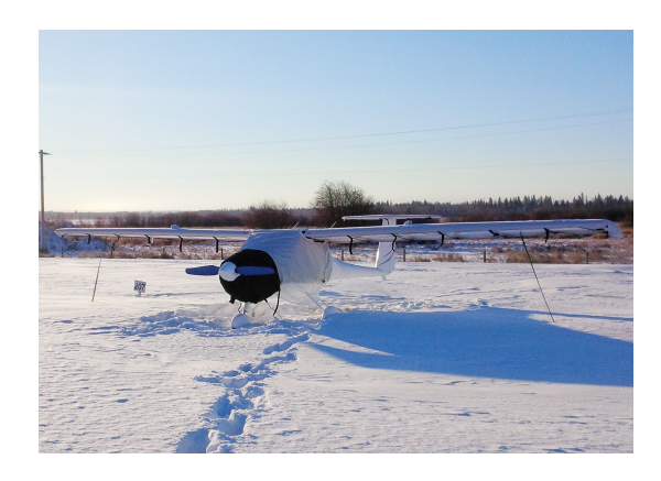
Pipistrel Canopy, Wings, Tail & Insulated Engine Covers

This cover type is made from Silver Acrylic Sunbrella canvas and is 100% lined with a soft and smooth microfiber. Bruce's Custom Covers developed this material combination especially for aircraft protection. The outer material is medium weight and treated for water resistance, UV resistance and anti-static buildup. The inner lining is a very soft and smooth microfiber to prevent scratching. The material is very reflective, and tests show that the cabin interior temperature can be reduced to near-ambient temperature on the hottest of days. It is water, ice and snow repellent, yet breathable to allow moisture to escape from between the cover and the aircraft surface.