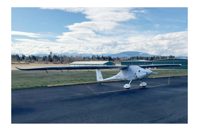
Pipistrel Sinus Wing Covers, All Year Use

WINTER USE MATERIAL - Made with Solution-Dyed Polyester fabric, this option is intended for seasonal use to aid in deicing, rain mitigation, or for occasional travel. The material is lighter and more compact, but more susceptible to UV damage and may have a shorter useful life if used continuously outside than the all-year use material.