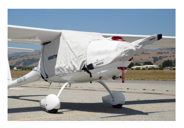
Pipistrel Virus Canopy & Prop Covers, Engine Plugs