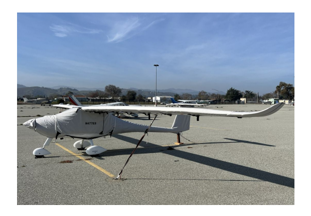
Pipistrel Sinus LSA Full Cover Set