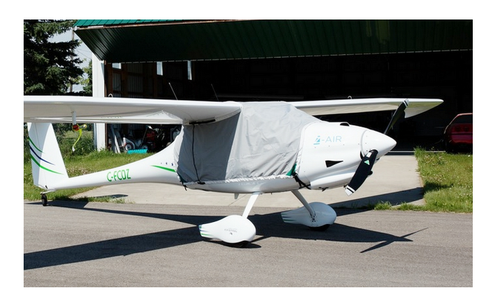
Pipistrel Light Weight Travel Canopy Cover