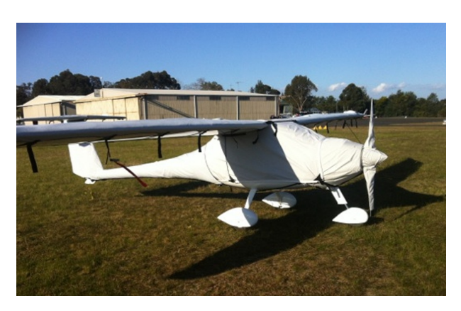
Pipistrel Full Cover Set