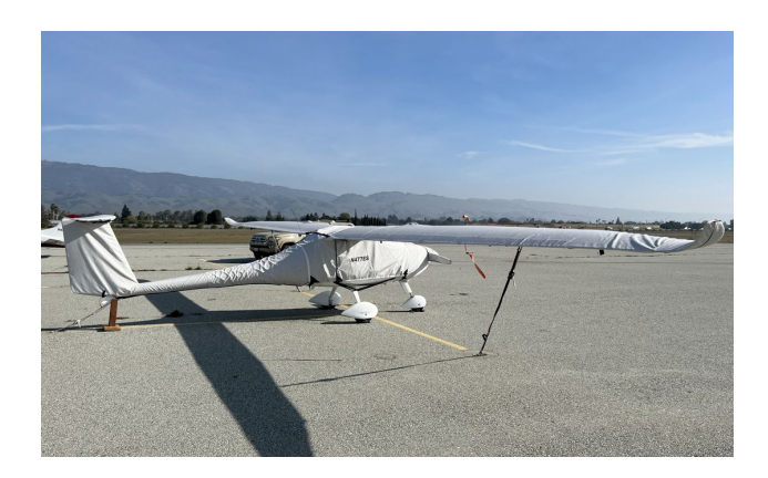
Pipistrel Sinus LSA Full Cover Set