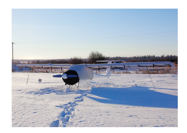
Pipistrel Canopy, Wings, Tail & Insulated Engine Covers

This cover type is made from Silver Acrylic Sunbrella canvas and is 100% lined with a soft and smooth microfiber. Bruce's Custom Covers developed this material combination especially for aircraft protection. The outer material is medium weight and treated for water resistance, UV resistance and anti-static buildup. The inner lining is a very soft and smooth microfiber to prevent scratching. The material is very reflective, and tests show that the cabin interior temperature can be reduced to near-ambient temperature on the hottest of days. It is water, ice and snow repellent, yet breathable to allow moisture to escape from between the cover and the aircraft surface.