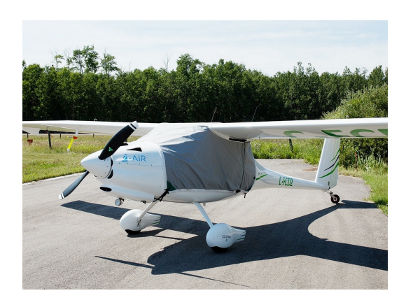
Pipistrel Light Weight Travel Canopy Cover

Travel Covers are made with Silver Solution-Dyed Polyester fabric and only lined over the windshield to save weight. The material is lightweight and more compact for easy stowage in the aircraft. The polyester material is water resistant, but only intended for occasional use outside. We also have an ultra lightweight material available for fitted hangar dust covers. For daily outdoor use, the non-travel Sunbrella Cover is the best choice.