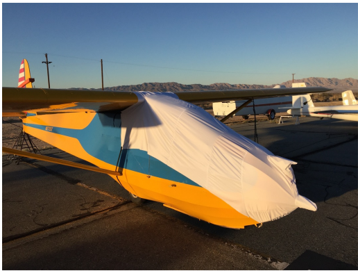
Schweizer SGU 2-22EK Canopy/Nose Cover, test fit cover