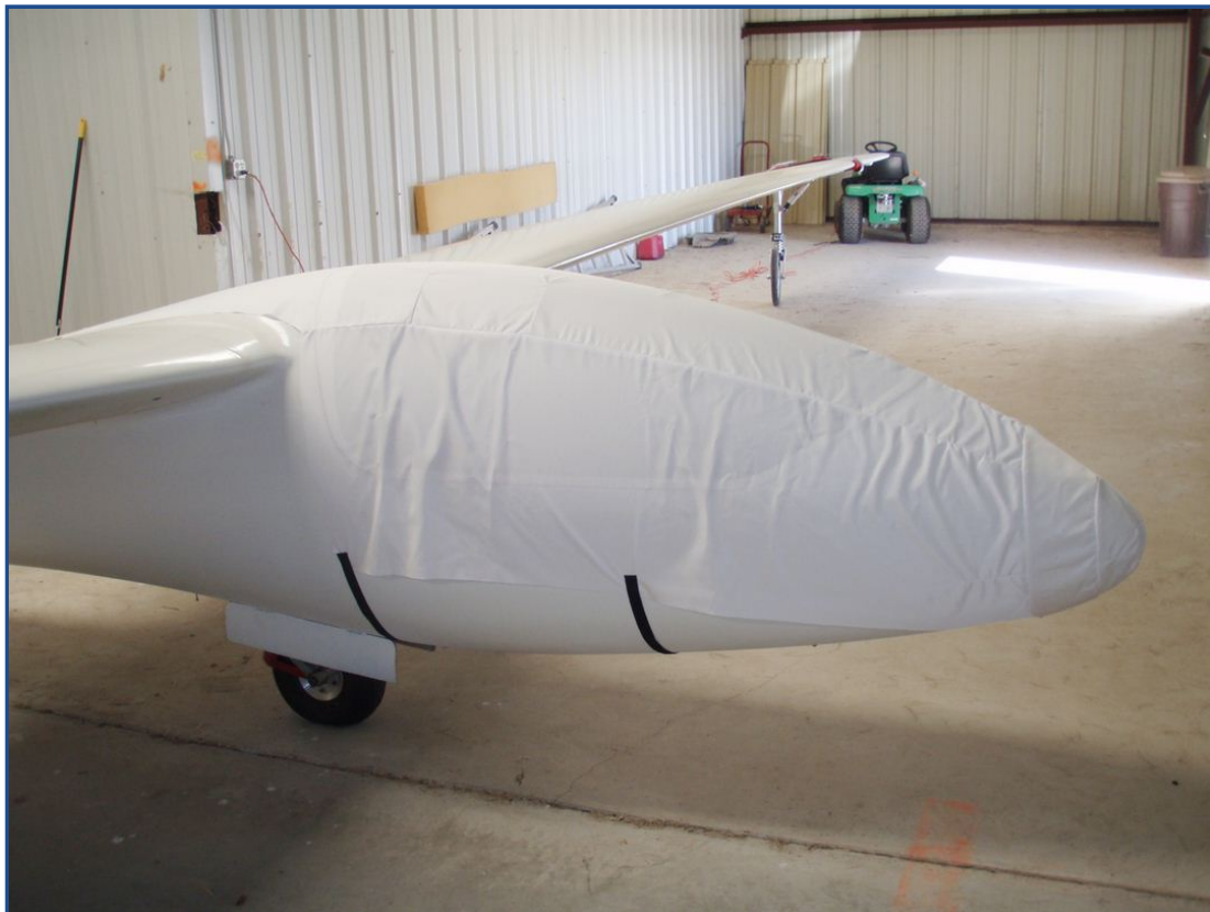
Bolkow Phoebus C-1 Canopy/Nose Cover, test fit cover