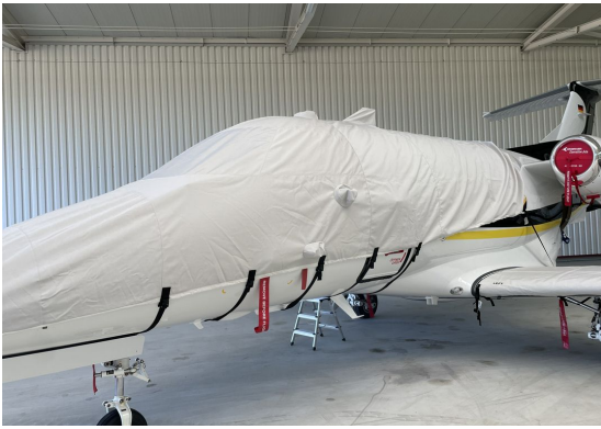
Embraer Phenom 100 Canopy/Nose Cover