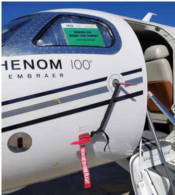
Phenom 100 (EMB 500) Pitot Cover/AOA Set

The Engine Inlet Plugs are custom fit for your Embraer Phenom 100 (EMB-500) intakes, made with heavy-duty vinyl material, and stuffed with a single block of sculpted urethane foam. Each plug has a zipper that allows the foam to be removed and dried if necessary. Engine plugs have 'remove before flight' streamers sewn onto the face of the plugs. Most plugs are imprinted with the aircraft registration number in black for an extra charge. Storage bag NOT included. Engine plugs may be inserted after flight when the engine is still warm. Engine Inlet Plugs are commonly referred to as Cowl Plugs, Intake Plugs, Cowl Blocks, Engine Blocks, and Engine Bungs.