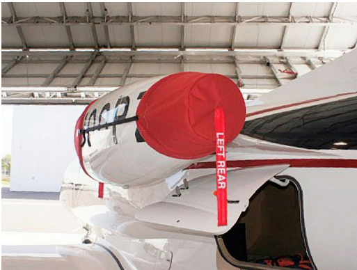
Embraer Phenom 100 Engine Covers set, Heat Resistant Pitot and AOA Covers & Phenom 100 Tri-fold style Engine Cover Set Interior Cockpit HeatShields set