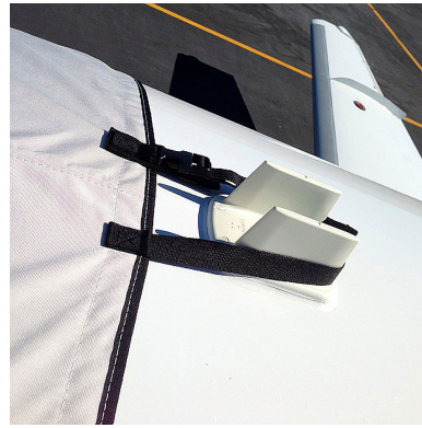
Phenom 100 EMB-500 Cockpit Cover (includes straps to hook around traffic antennae so the cover will not slip forward)