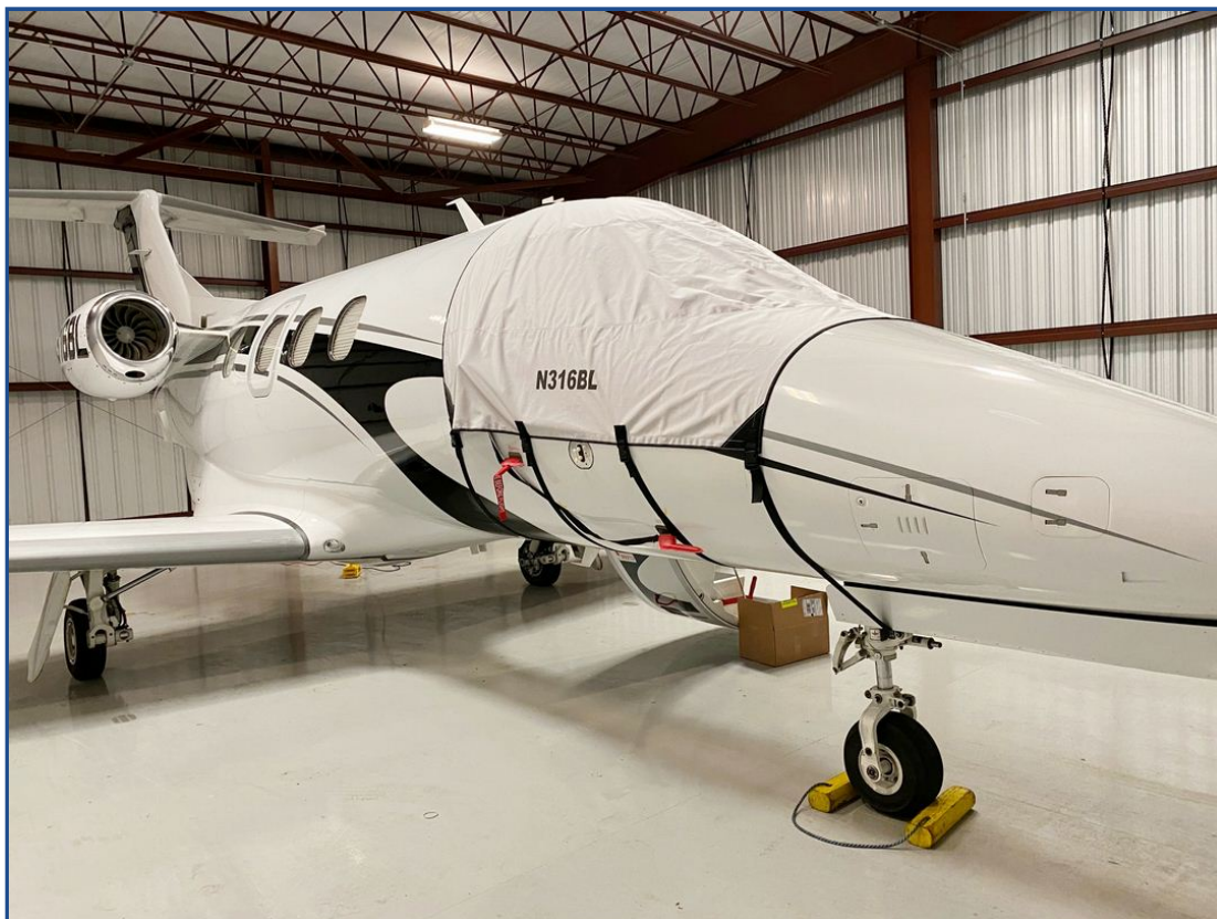
Embraer Phenom 100 Cockpit Cover