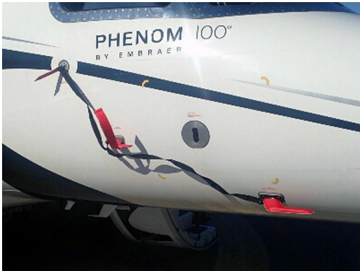
Embraer Phenom Pitot Cover/AOA Set, Heat Resistant Type