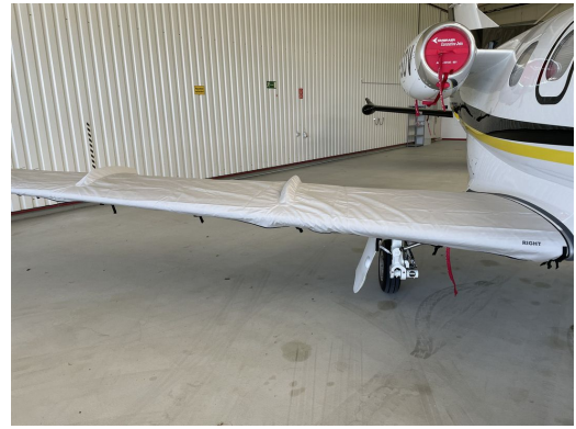
Embraer Phenom 100 Canopy/Nose Cover