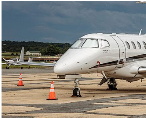
Embraer Phenom 100 Cockpit HeatShields

Cockpit Heatshields are interior sunshades for the aircraft's cockpit. The product is a unique composite of closed-cell foam with a silver mylar finish. The semi-rigid design is stiff enough to stand inside the window framing. The set folds up flat and is easily stored in the included storage sleeve. Some designs may require velcro and suction cups. Our Heatshields for jets are offered white side out because some aircraft manufacturers have issued advisories against reflective window inserts due to potential heat damage. A Heatshield is an excellent short-term remedy for cockpit overheating, but an external fabric cover is more effective for long-term protection.