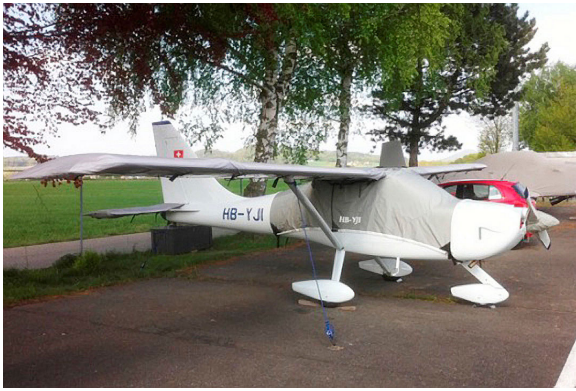
OMF Symphony Canopy, Wings, Horiz. Stab, and Prop Covers