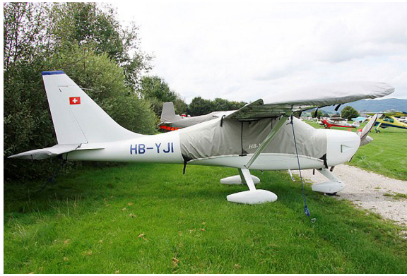
Glstar Canopy, Wings, Horizontal Stab. & Prop Covers