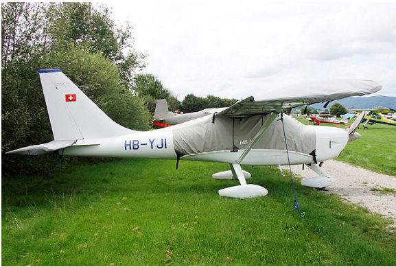
Glastar Canopy, Wings, Horizontal Stab. & Prop Covers

WINTER USE MATERIAL - Made with Solution-Dyed Polyester fabric, this option is intended for seasonal use to aid in deicing, rain mitigation, or for occasional travel. The material is lighter and more compact, but more susceptible to UV damage and may have a shorter useful life if used continuously outside than the all-year use material.