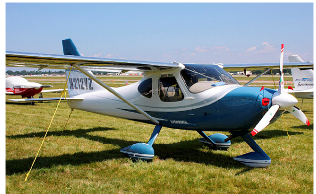
Glastar Sportsman Engine Inlet Plugs