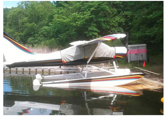
Glstar Sportsman Canopy Cover