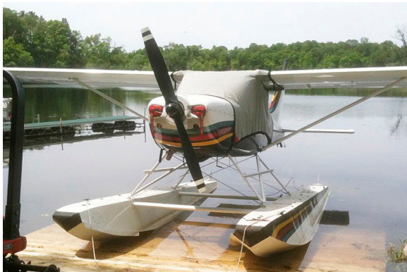
Glastar Sportsman Canopy Cover and Engine Plugs

Engine Inlet Plugs are custom fit for your Ultravia Pelican intakes, made with heavy-duty vinyl material, and stuffed with a single block of sculpted urethane foam. Each plug has a zipper that allows the foam to be removed and dried if necessary. Engine plugs have warning flags that are visible from the cockpit or 'remove before flight' streamers sewn onto the face of the plugs. Most plugs are imprinted with the aircraft registration number in black for an extra charge. Storage bag NOT included. Engine plugs may be inserted after flight when the engine is still warm. Engine Inlet Plugs are commonly referred to as Cowl Plugs, Intake Plugs, Cowl Blocks, Engine Blocks, and Engine Bungs.