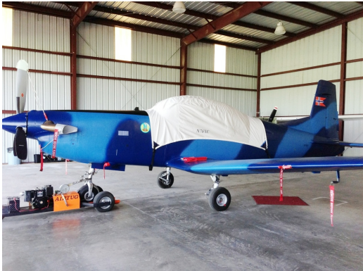
Pilatus PC-7 Canopy Cover

Travel Covers are made with Silver Solution-Dyed Polyester fabric and only lined over the windshield to save weight. The material is lightweight and more compact for easy stowage in the aircraft. The polyester material is water resistant, but only intended for occasional use outside. We also have an ultra lightweight material available for fitted hangar dust covers. For daily outdoor use, the non-travel Sunbrella Cover is the best choice.