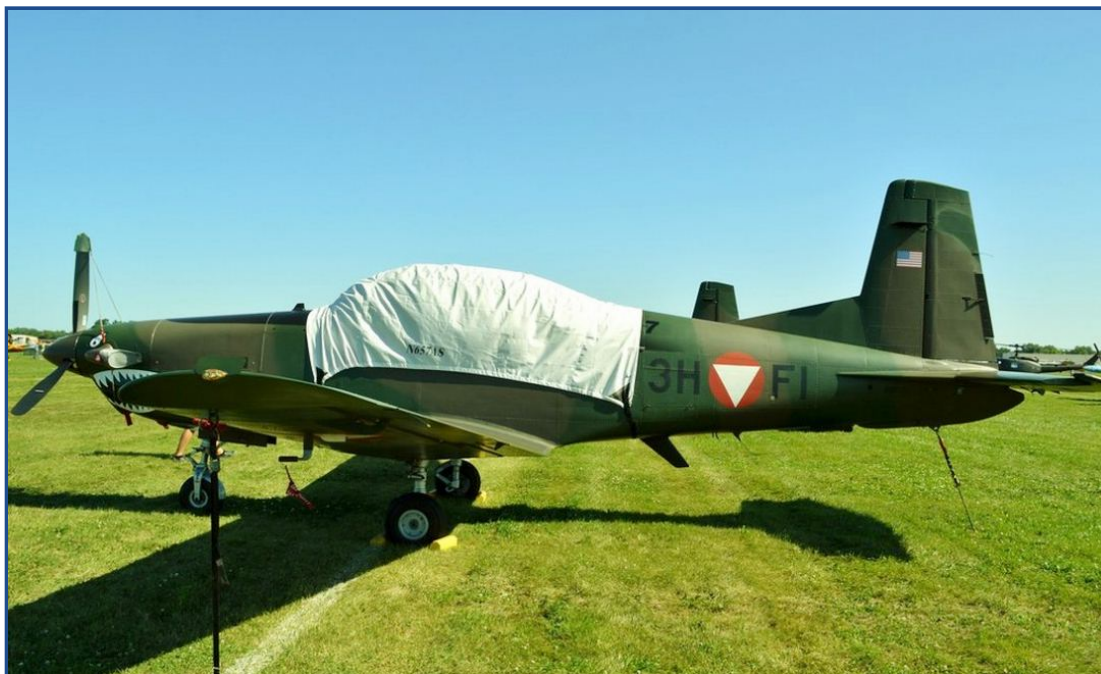
Pilatus PC-7 Travel Weight Canopy Cover