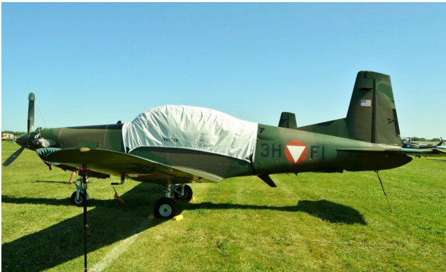
Pilatus PC-9 Canopy Cover, Prop Tie-Down, Engine Plug, Pitot Cover