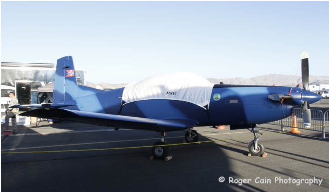
Pilatus PC-7 Canopy Cover