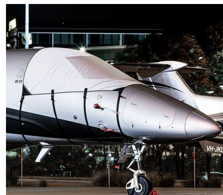
Pilatus PC-24 Cockpit Cover