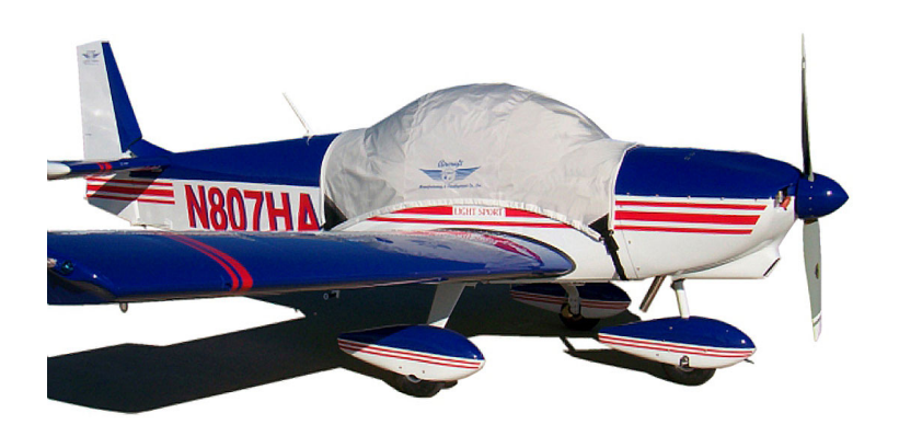
Alarus Canopy Cover