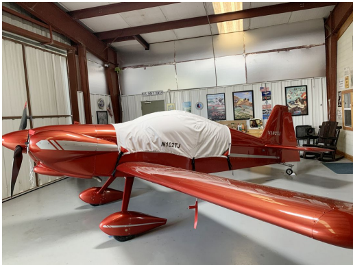
SPA Sport Panther Canopy Cover